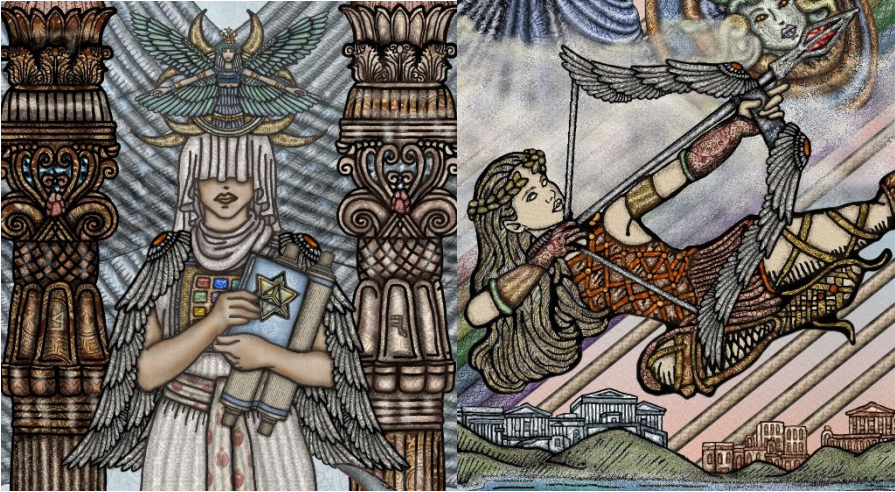
Left: Bow of Artemis cloaking the priestess. Right: Artemis in the Eight of Scepters

Thus, in the Crowley-Harris Thoth rendering of Key II: The Priestess, presented by the priestess's waistline is Artemis's bow and arrow. Here, the wings of the veiled priestess call to mind the form of Artemis's bow illustrated in The Sharpshooter, Eight of Scepters.