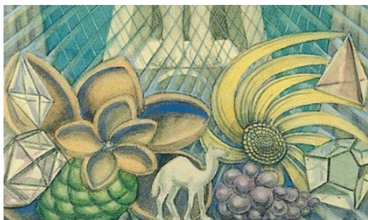
Bottom foreground of the Thoth Priestess

In the Book of Kings, there's also a reference to King Solomon later worshipping Ashtoreth, goddess of the Sidonians (now modern-day Lebanon). Ashtoreth's Akkadian equivalent is Ishtar, and in Sumer was known as Inanna. Inanna was the patron goddess and source of King Solomon's magical powers.