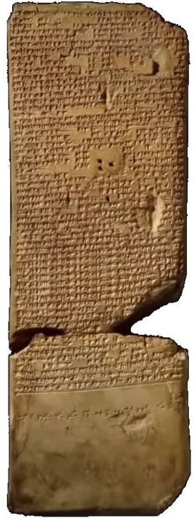
Ishtar, from the Library of Ashurbanipal in Nineveh (700-601 BC)