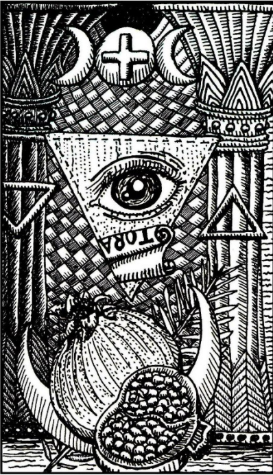
Sanctuary of Isis