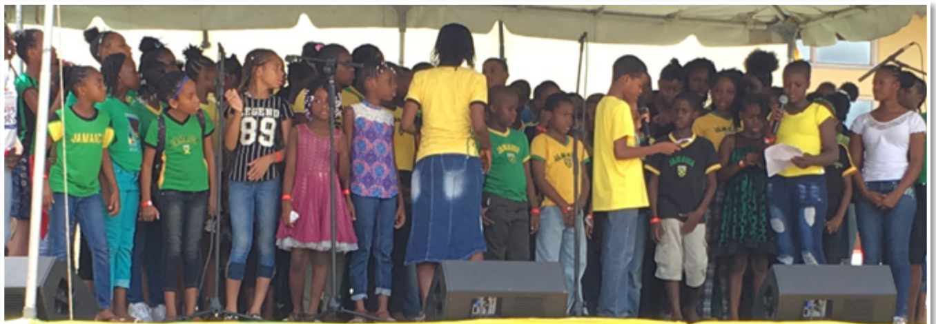
► Children giving a presentation during the Jamaica Union Children's Convention