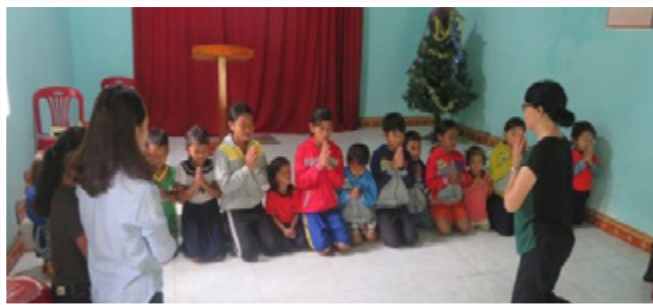
► VBS Children

cal Charity Program. Children raised fund for orphanage and “crystal-bone” children. They earned 320 USD. They gave rice, food . . . and also their toys and books. We hope every child will learn about Jesus and apply lessons in their lives everyday.