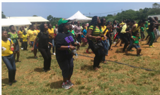
► Jamaica Lets Move