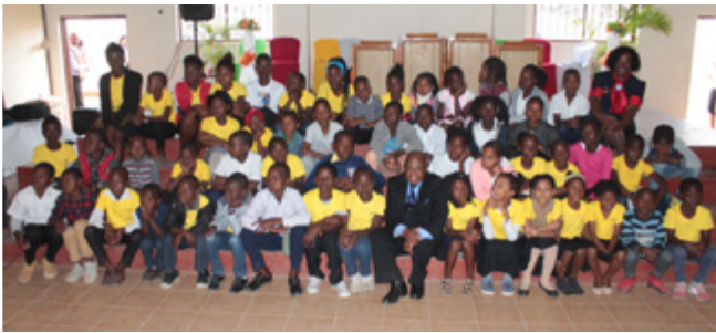
► Children who accepted call to Pastoral Ministry and becoming Literature Evangelists