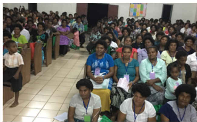
► Part of the Delegates in Fiji