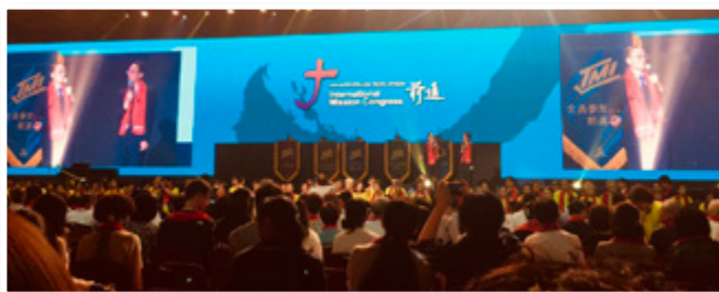
► NSD Mission Congress