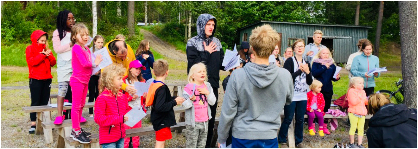
► Outdoor Worship at camp