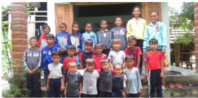
► VBS Children