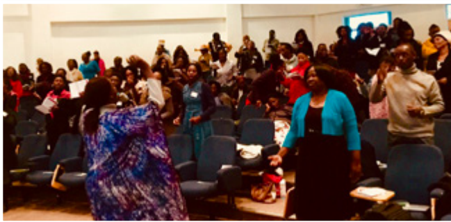
► Botswana Union CHM Leadership Training