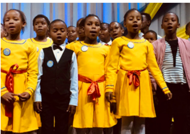
► Children singing at the convention