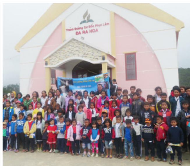
► VBS Children in Quang Ngãi, Central Vietnam

In early June, VBS was organized in Phu Nhuan Church in HCM city. This year our VBS Theme is "Service Others Like Jesus Did" After 8 days attended VBS they finished by Musi-