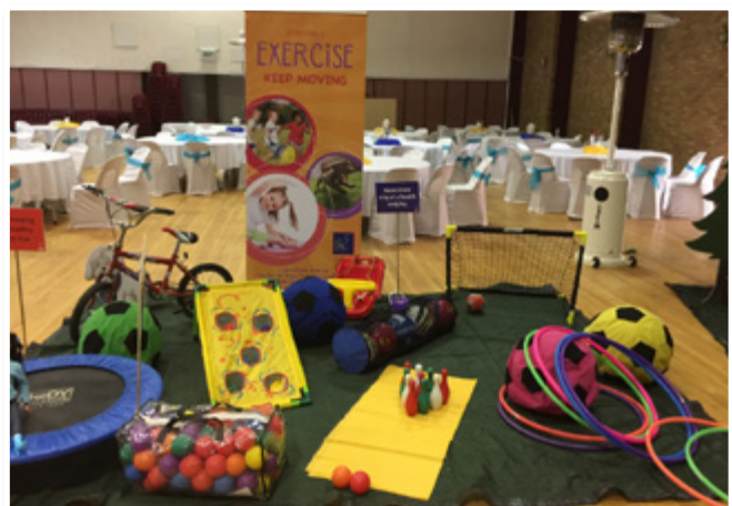
► Health EXPO station