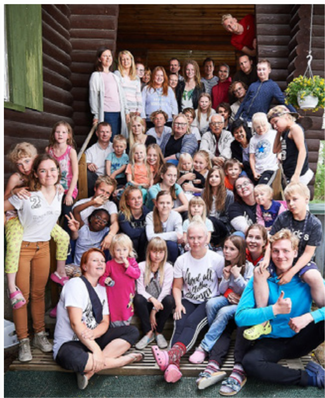
► Finland’s Family Camp

The children participated in many outdoor activities such as boatrides, swimming, diving, games, etc. The water was icy cold, but everyone got into the sauna before jumping into the water. It was amazing how they can endure the cold water. It was indeed a fun-filled camp that provided opportunities for bonding and nurturing.