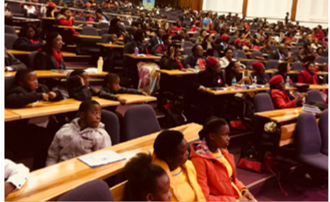
► Southern Africa Union Children's Leaders' Convention

More than 250 children's leaders and teachers from all over the union attended this CHM leaders' convention, May 24-27, 2018 at the union headquarters in Bloemfontein. The whole compound was buzzing with excitement, colors, and action all throughout the event. The singing was absolutely fantastic with lots of action songs and movements. The theme