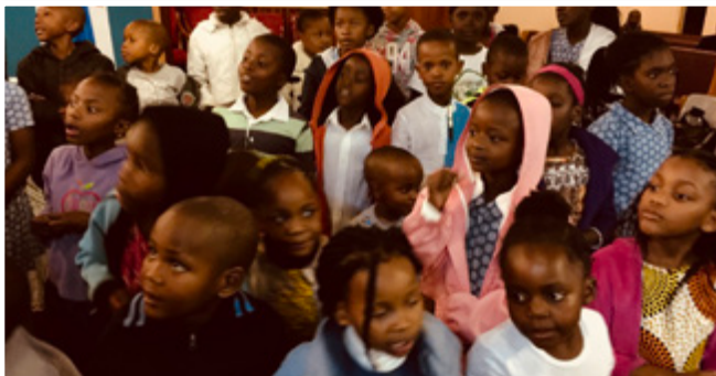
► Gaborone Church Children's Week of Prayer