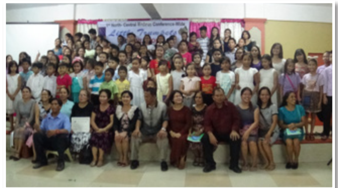
► Little Trumpets Convention

Heartwarming testimonies from several children who because of the ministry of the Little Trumpets ministry, have become Adventists. They accepted Jesus through the Bible studies given by the children. We praise God for using children to finish his kingdom work.