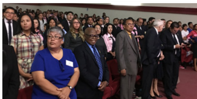
► Part of the 980 delegates