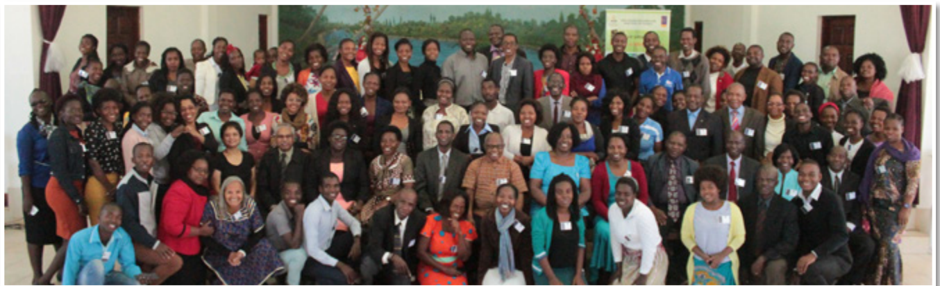
► Leaders at Fomento SDA Church