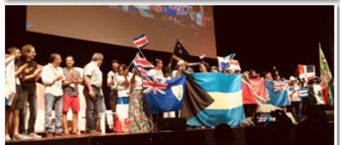
► GC Youth Leadership Convention in Kessel