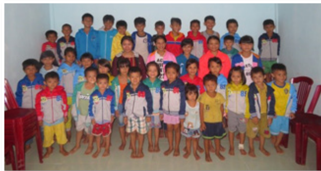
► VBS Children