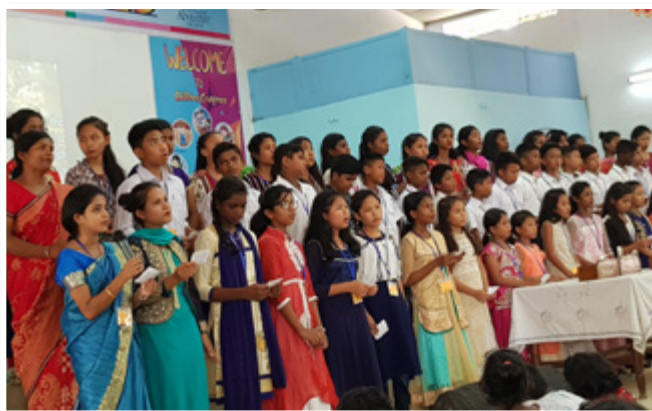
► Bangladesh Children's Congress