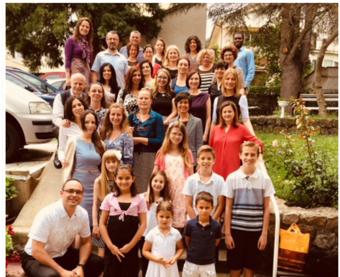
► Serbian CHM Leaders Training

The children's leaders were so glad to receive many free resources for their ministry. Many expressed appreciations for the training provided.