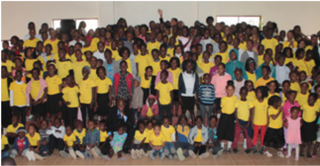
► Children who accepted call to Baptism