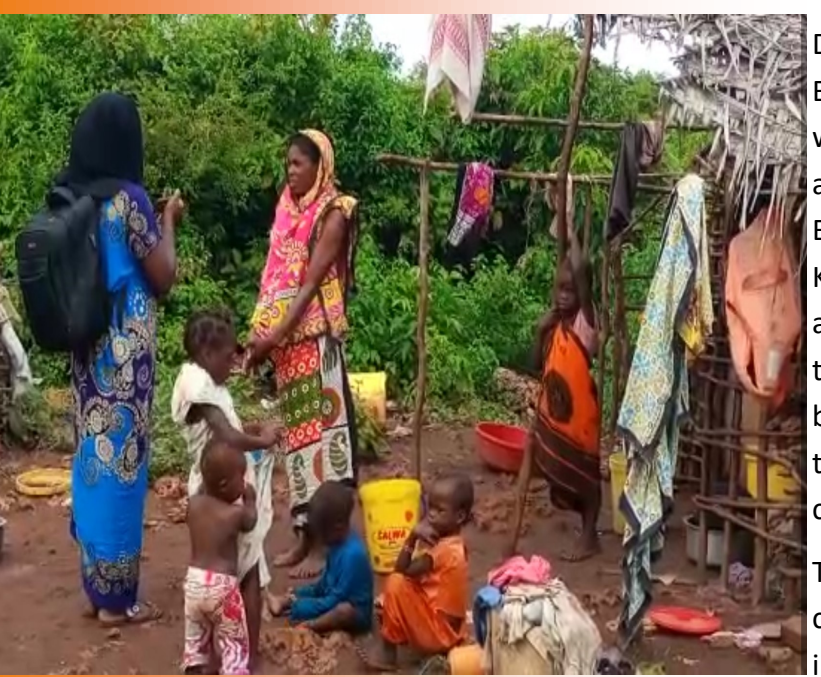
Selection of new households

Due to the success of the Community Based HomeCare and Beekeeping project where 90 per cent of 360 households were able to transform their living conditions after 3 years of actively participating in the project, under the Community Based HomeCare Child Protection and Beekeeping project, KidsCare found a need to empower more villages by selecting another set of 24 villages with the most needy 360 household to embark on a journey of a bright side. This was also inspired by the request from local authorities and the communities themselves after witnessing KidsCare's visible impact to the communities.