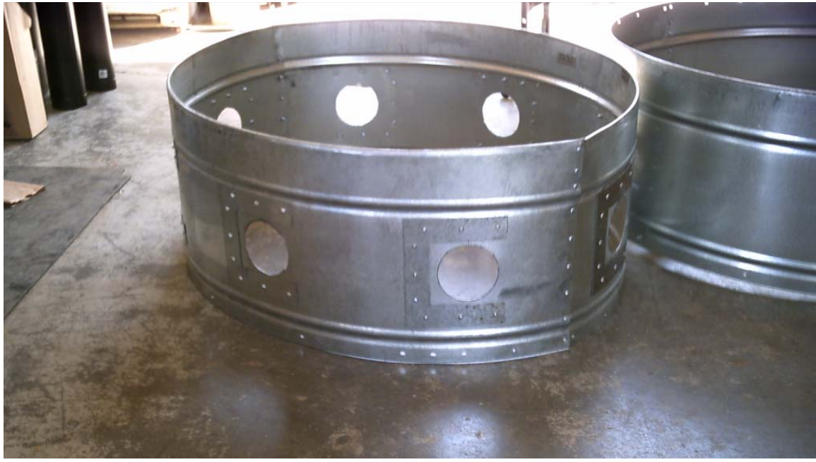
Figure 5. Lower body section with cutout holes and C-brackets installed.