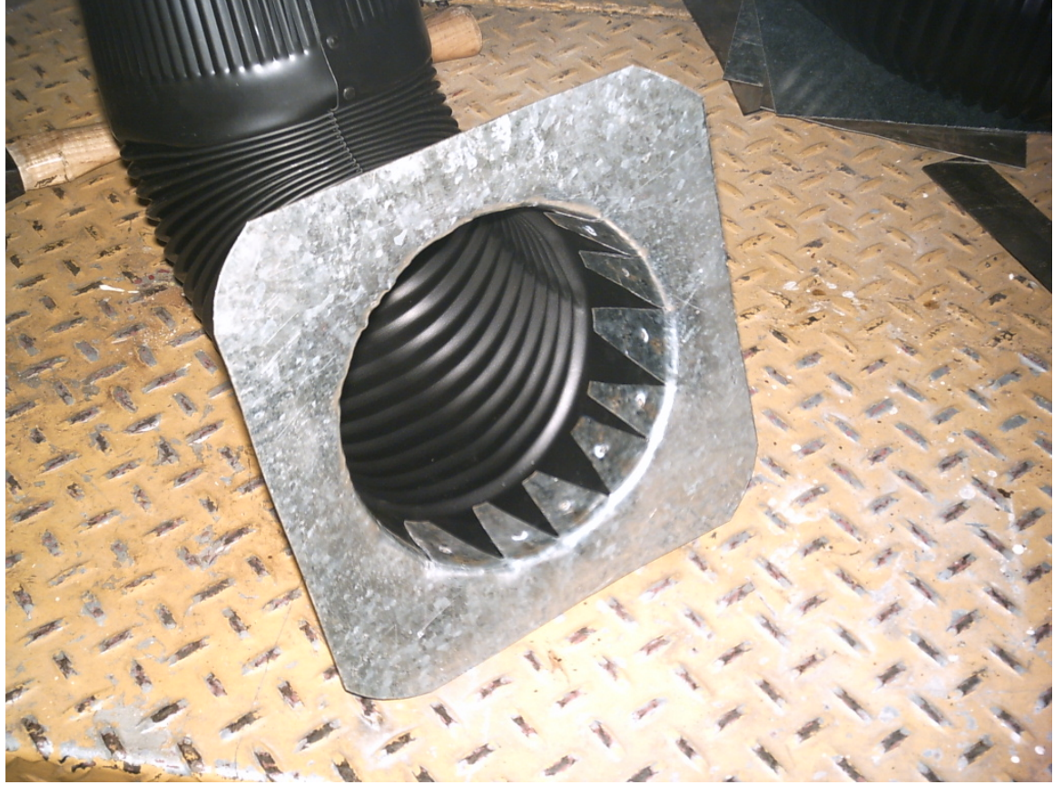
Figure 6. Detail of exhaust flange and elbow assembly.