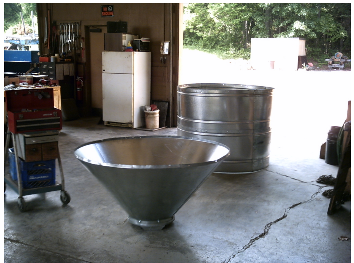
Figure 4. Kiln body and bonnet unmodified from pre-fabricated bulk bin kit.

Several photographs help illustrate various steps in construction. Figure 4 shows the kiln body and bonnet components assembled but unmodified from the pre-fabricated bulk bin kit design. The lower half of the body section is shown with exhaust/damper holes cut out and mounting brackets installed in Figure 5. A close-up of an exhaust flange assembly is shown in Figure 6. We've used several different versions of the flange assembly. The one shown is relatively easy to build, durable and rigid when attached to the kiln.