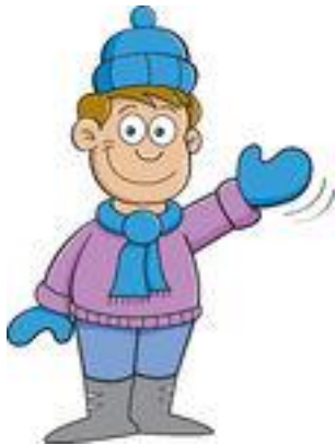
scarf, ear muffs and boots