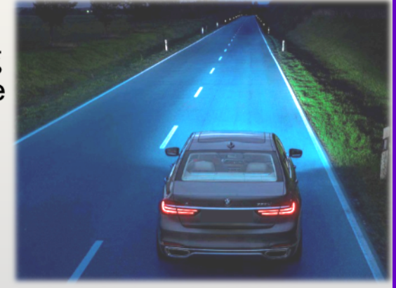
We'll Inspect Your EXTERIOR LIGHTS at NO CHARGE. If Any Light Needs Replaced, We'll Knock 10% OFF the Regular Price of the Repair!

Daylight Savings Time ends November 4th. That means fewer hours of daylight for your upcoming holiday travel. Before hitting the road, make sure your vehicle's lights are in proper working order.