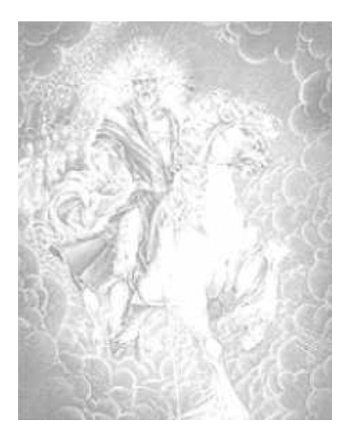
Revelation 1:7 Behold, he cometh with clouds; and every eye shall see him, and they also which pierced him: and all kindreds of the earth shall wail because of him. Even so, Amen.

REVELATION 22:1-5 Vs.2 In the midst of the street of it, and on either side of the river, was there the tree of life, which bare twelve manner of fruits, and yielded her fruit every month: and the leaves of the tree were for the healing of the nations.