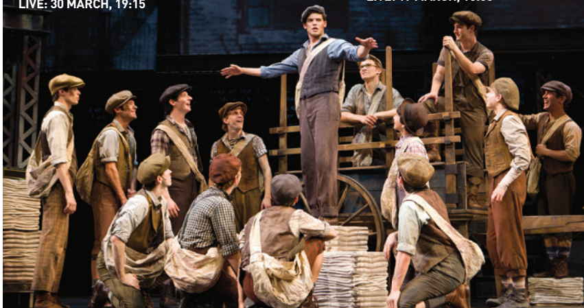
Newsies: The Broadway Musical