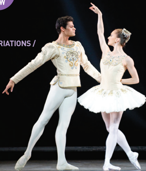
Royal Opera House: Jewels