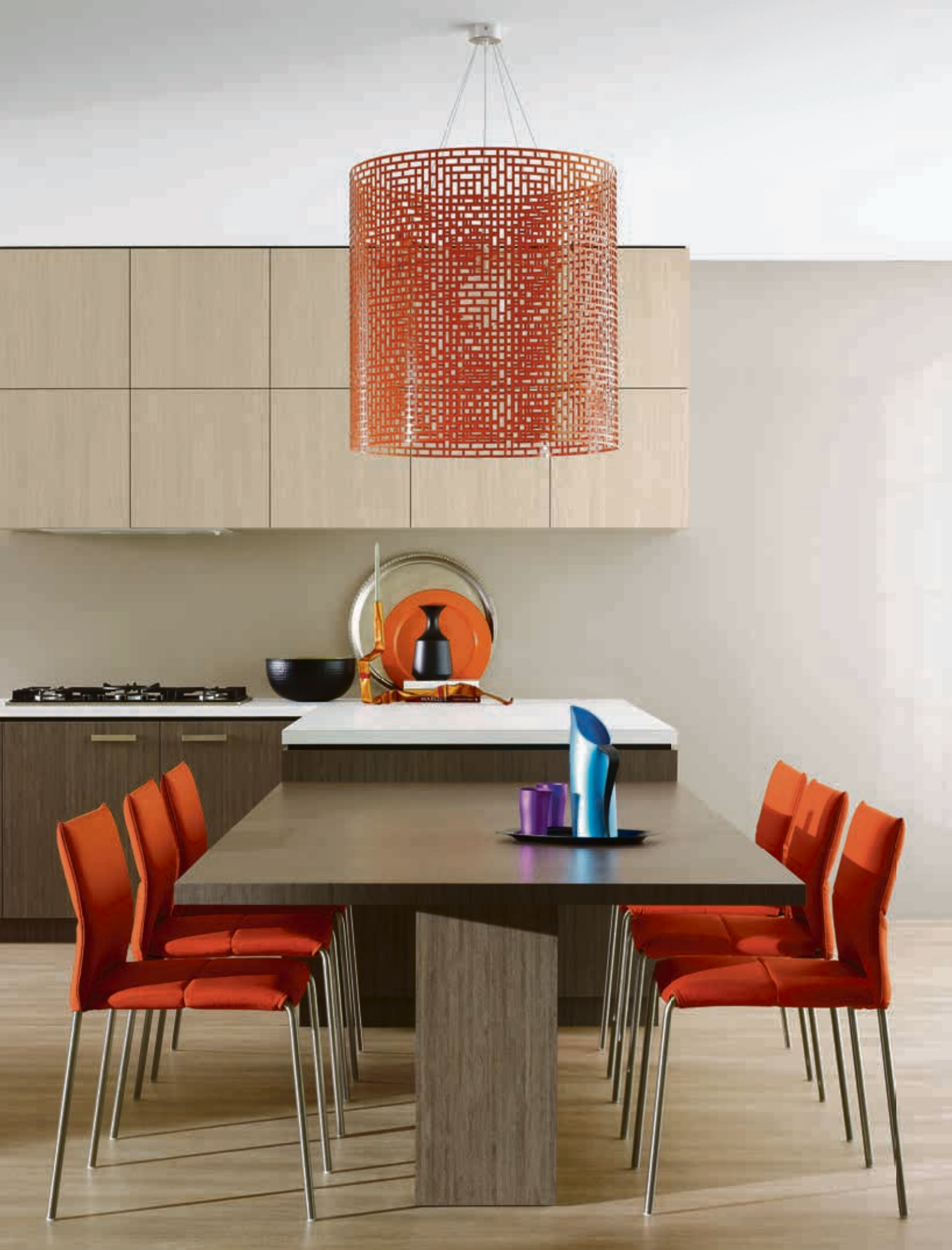
This page: Dining table and lower cupboards in Laminex Colour Palette Jericho. Upper cupboards in Laminex Colour Palette Whitewashed Oak. Benchtop in Laminex Impressions Polar White Spark finish. Splashback Metaline Smoked Silver Perle.