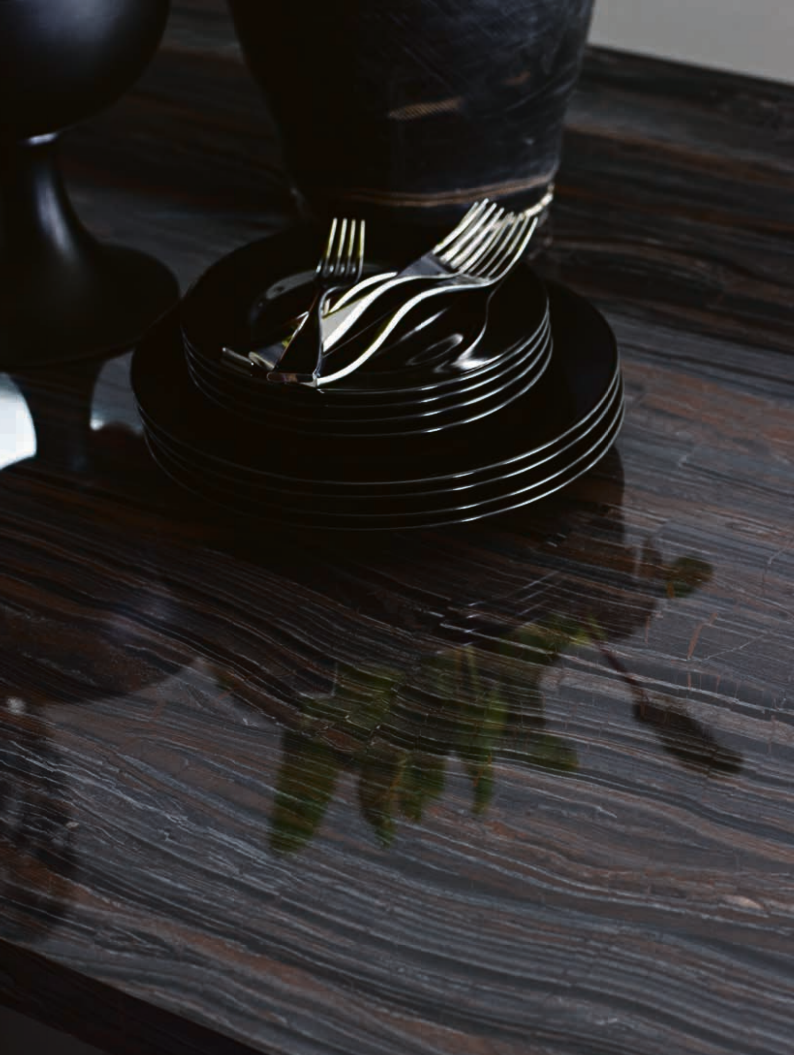
Front cover and opposite page: Island bench in Laminex Colour Palette Moose and panels in Laminex Silk Finish Moose. Overhanging benchtop in Laminex DiamondGloss Black Ironstone. Cupboards and doors in Laminex Silk Finish Zincworks. Raised Island benchtop in Laminex Freesyle Arctic White. Oven unit in Laminex Designed Timber Veneers Ironbark Wave. This page: Benchtop in Laminex DiamondGloss Black Ironstone.