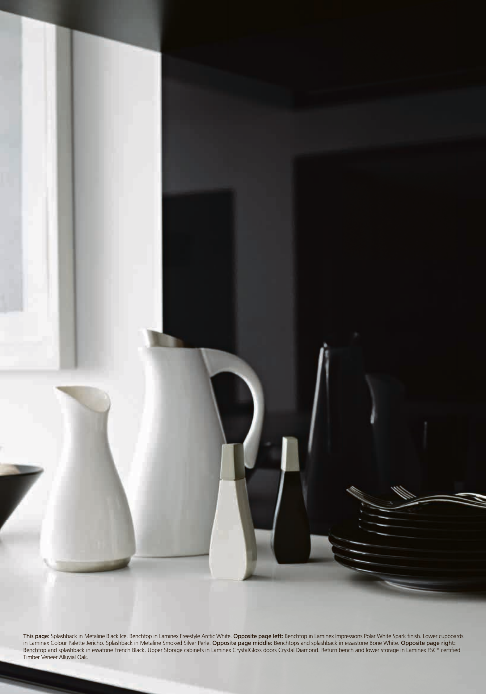
This page: Splashback in Metaline Black Ice. Benchtop in Laminex Freestyle Arctic White. Opposite page left: Benchtop in Laminex Impressions Polar White Spark finish. Lower cupboards in Laminex Colour Palette Jericho. Splashback in Metaline Smoked Silver Perle. Opposite page middle: Benchtops and splashback in essastone Bone White. Opposite page right: Benchtop and splashback in essastone French Black. Upper Storage cabinets in Laminex CrystalGloss doors Crystal Diamond. Return bench and lower storage in Laminex FSC® certified Timber Veneer Alluvial Oak.