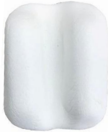
Achilles Tendon Pad – Style A