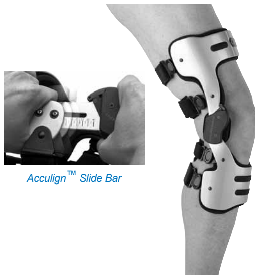
Acculign™ Slide Bar

Indications: Post-op, rehab and functional support plus unloading for protocols requiring reduced medial or lateral joint loads during recovery; ACL, MCL, PCL, LCL, rotary or combined instabilities; Low to moderate contact/impact activities