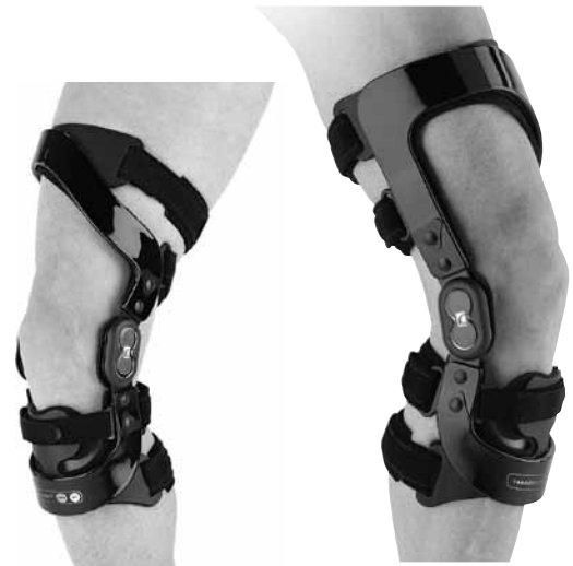
Medial View of Paradigm