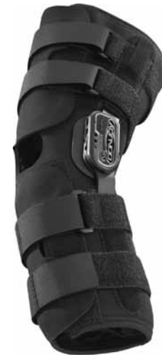
Playmaker Sizing Chart