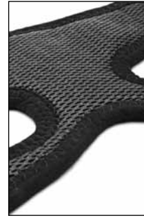
Silicone padded liners

Indications: ACL, PCL, MCL, LCL, rotary and combined instabilities; Standard model for medium to high impact levels; Pro Sport model for highest impact level