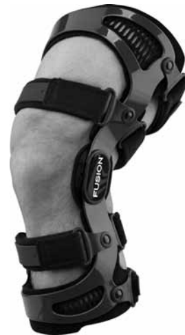
Fusion Knee Brace