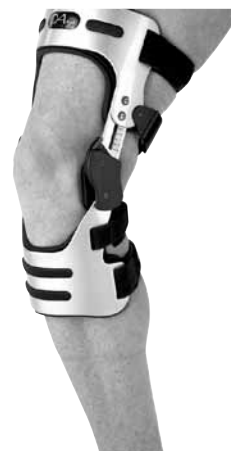
Medial View of OAsys

*M/L at joint width in a standard, weight-bearing position