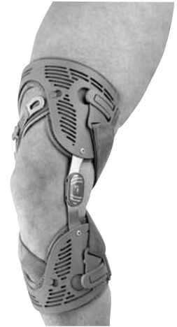
Medial View of Right Medial Unloader One