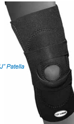
Lateral "J" Patella