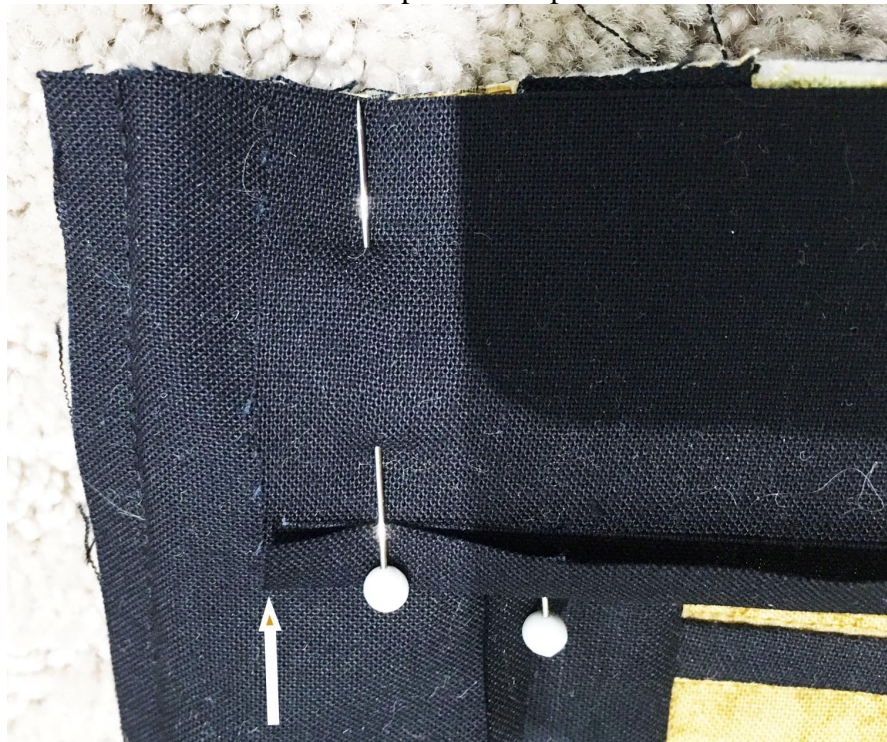
Arrow shows where strip ends.