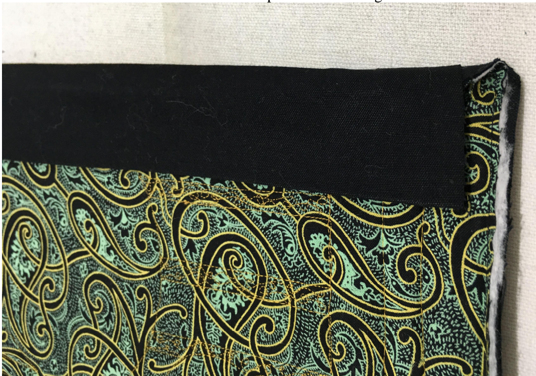
View from the back with side strips steamed in place.