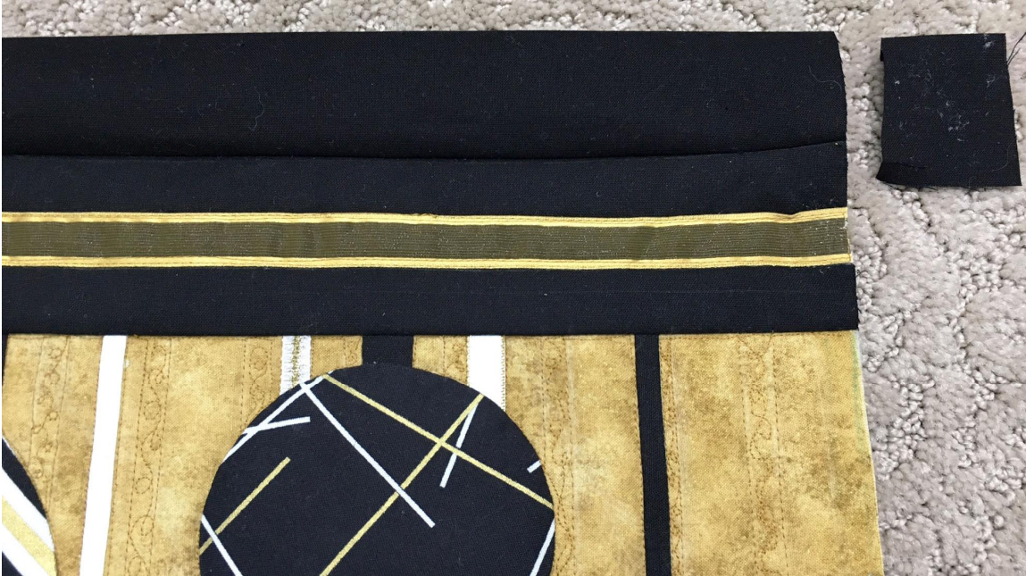
Excess trimmed after pressing.