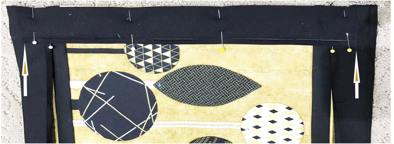
Arrows indicate where strips end.