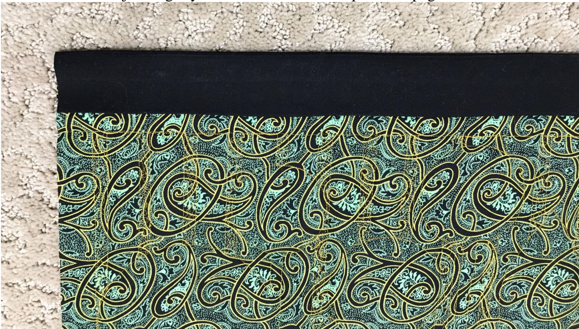
Strip steam pressed over back.