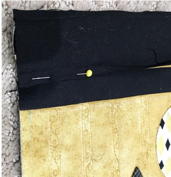
Strip pulled onto the front and pinned.

Make sure the ends are pinned flat and even with the top.