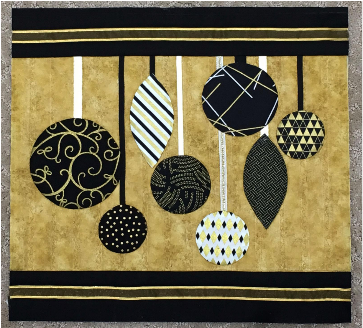
All layers (batting, backing and top) trimmed around the outside.

Start by squaring your project so the backings, batting and top are all trimmed to the same size. I use my Karen Kay Buckley's Perfect Adjustable Square. I build the acrylic pieces to the finished size plus seam allowance so trimming is accurate and a breeze. And, don't let the name fool you, it can be built to rectangular sizes also.