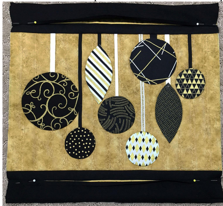
View from the front with both strips pinned.

Make sure the ends are pinned flat and even with the top.