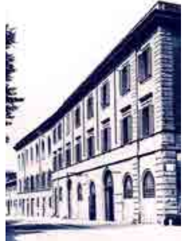
The International College Seraphicum in Rome. In the chapel of this College St. Maximilian conceived the idea of founding the Militia Immaculatae. On the left: The building in our time. On the right: The building at time of St. Maximilian.