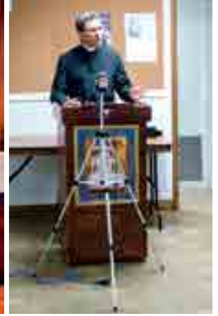
Enrolment into the Militia Immaculatae and conference in Winnipeg

of the Most Holy Rosary in Levis, Quebec, explaining to them the importance of the M.I.