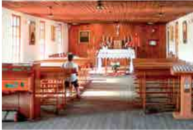
The chapel in Niepokalanów

Even though, prior to the pilgrimage, I had read a lot of books on Saint Maximilian, nothing could prepare me for the privilege of standing, praying, and attending Holy Mass in the very places