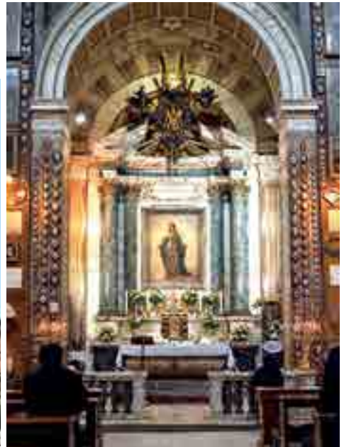
Father Maximilian offered his first Holy Mass on the same altar where the Immaculata had appeared to Ratisbonne.