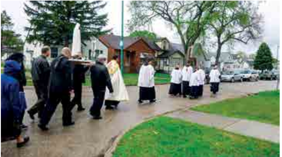
Rosary procession in Winnipeg