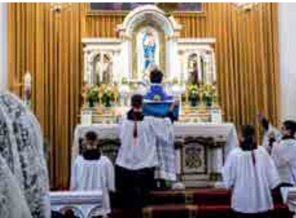
Holy Mass in Winnipeg