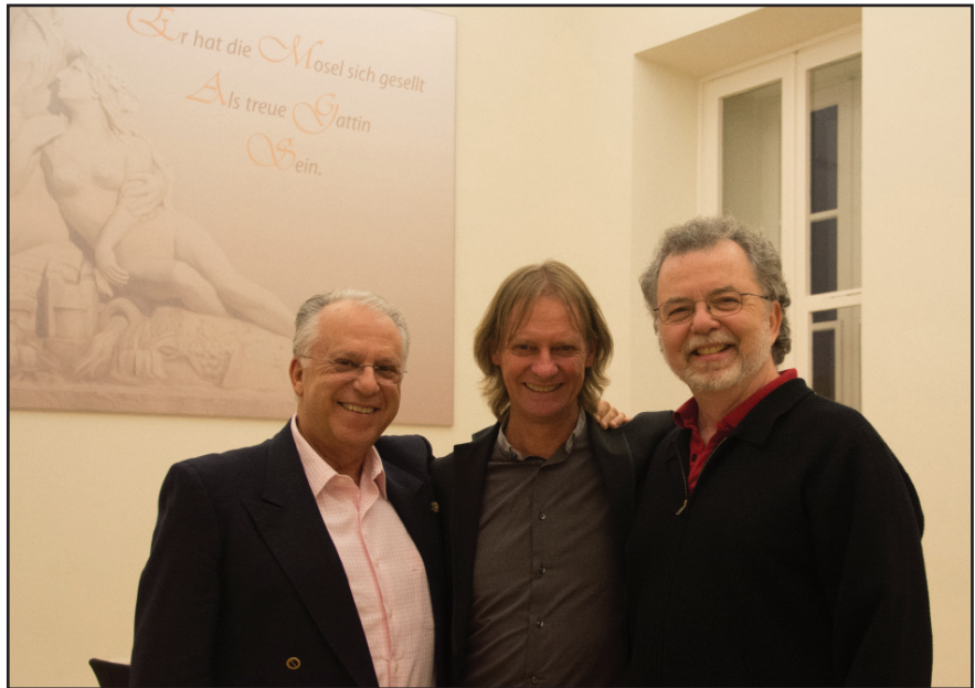
Pepe Romero, David Russell and Manuel Barrueco.