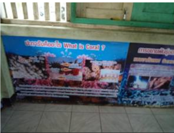
The Koh Sukorn community has already been actively conducting workshops and preparing interpretive materials to plan for tourism and the protection and enhancement of cultural and environmental values