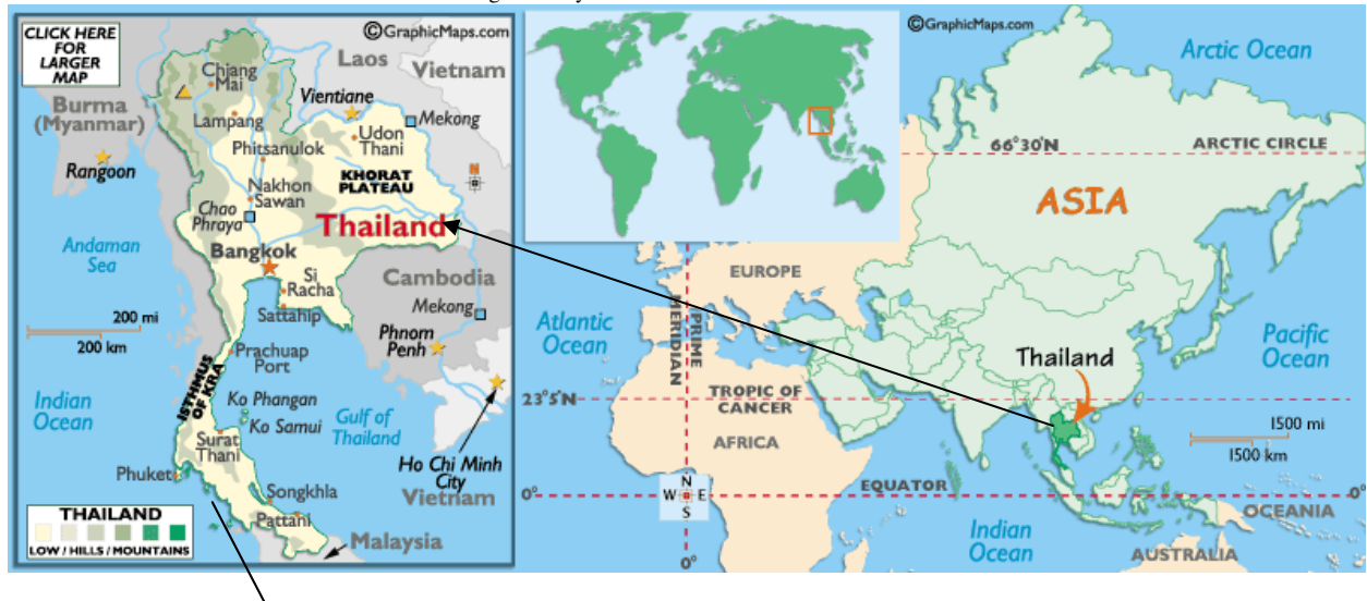
Where is it? www.worldatlas.com/webimage/countrys/asia/th.htm