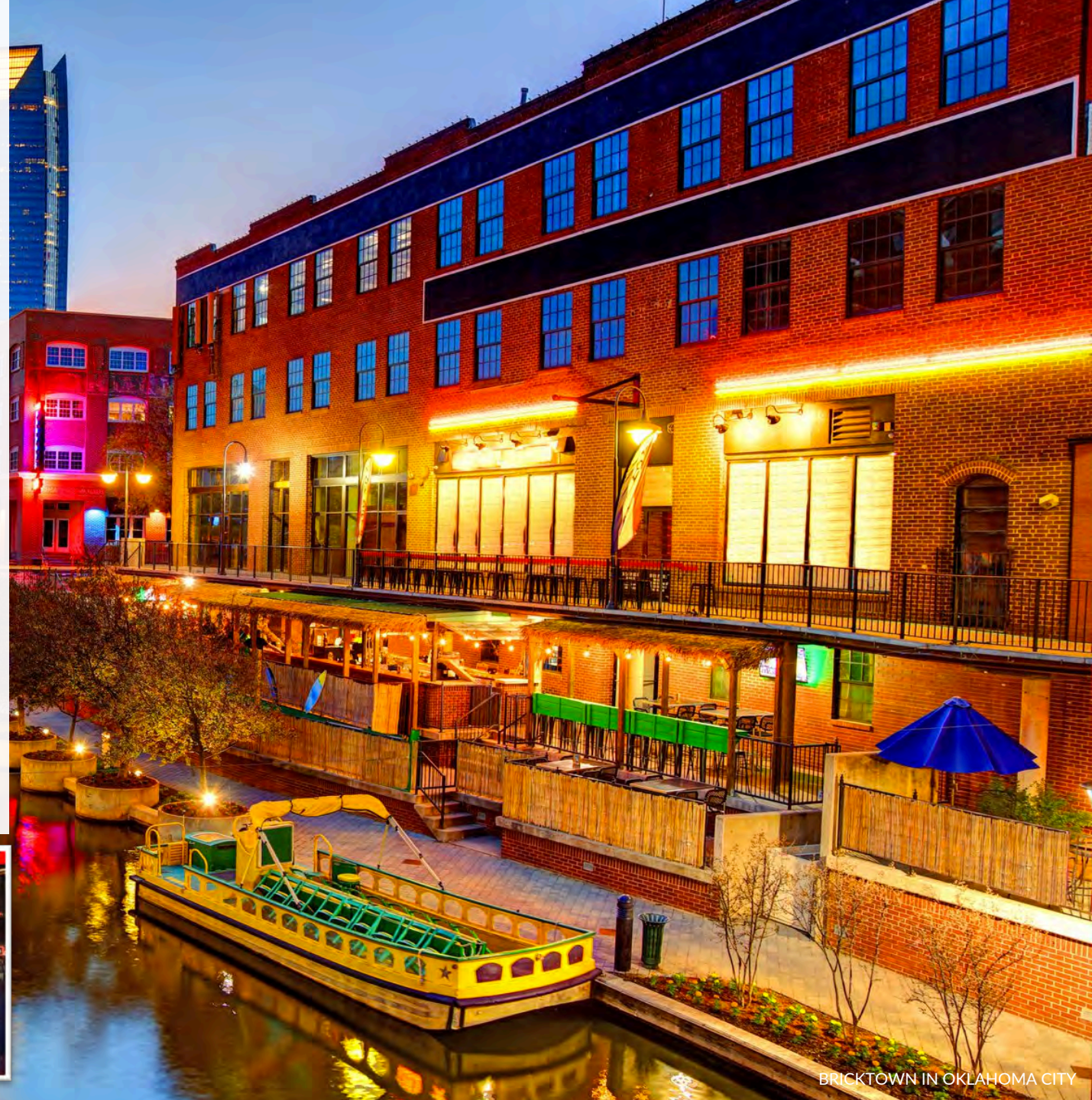
BRICKTOWN IN OKLAHOMA CITY