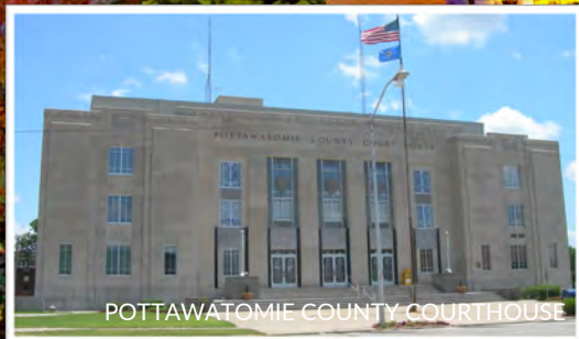
POTTAWATOMIE COUNTY COURTHOUSE

Shawnee is home to numerous casinos, some being: FireLake Casino and Entertainment Center, the Black Hawk Casino, Kickapoo Casino Shawnee and the Thunderbird Casino. Most of the casinos offer slot machines, table games and bingo, plus some even have an on-site buffet, grill and bar. The city is also home to the Mabee-Gerrer Museum of Art which is a wide-ranging collection of art from Egyptian & Greek to Renaissance & Native American works. The city is close to Oklahoma City which is home to the Industrial-chic Bricktown, which is a lively entertainment district with repurposed warehouse spaces home to restaurants and chic winebars.