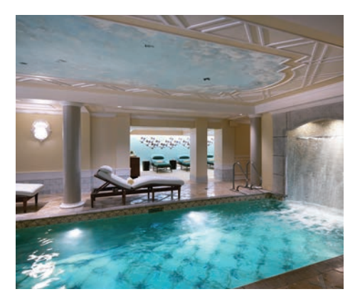
Kohler Waters Spa Kohler, Wisconsin

Release stress, reconnect with loved ones, and most of all, reconnect with yourself at Kohler Waters Spa, the only Forbes five-star spa in Wisconsin, Conveniently located next to The American Club<sub>®</sub>, guests can drop in for a nourishing treatment or all-day immersion of the latest therapeutic water treatments and results-oriented facial and body treatments. From soothing, water-inspired treatment rooms to inviting respite room areas and warm relaxation pool. Kohler Waters Spa provides wellbeing around every corner. Enjoy the enclosed rooftop deck with whirlpool, fireplace and loungea relaxing coed area to be enjoyed year-round.