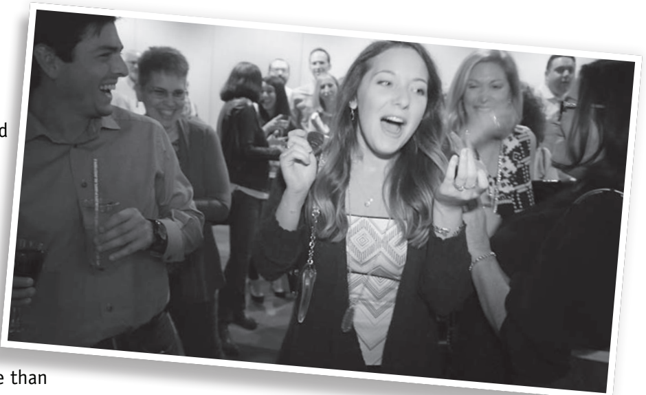
120th Anniversary Kickoff Celebration: Denim & Diamonds