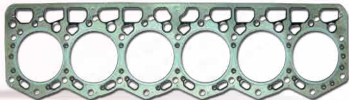
《 S6D110 》