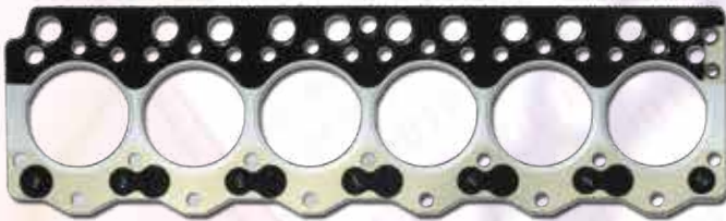
《 S6D95 》 (Stainless)