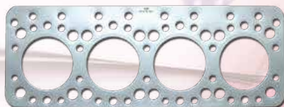
《4D120 / 4D130》