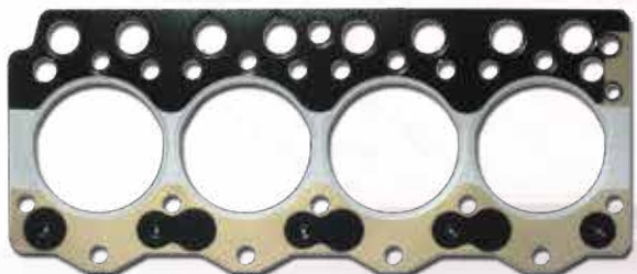
《4D95 / S4D95》 (Stainless)