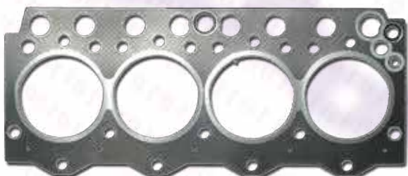
《4D95 / S4D95》