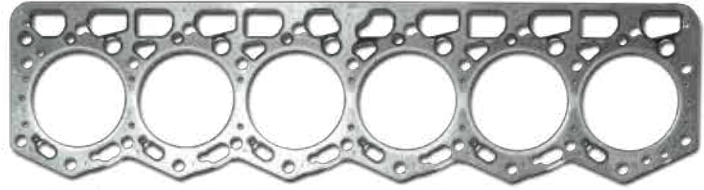
《 S6D105 》 (Stainless)