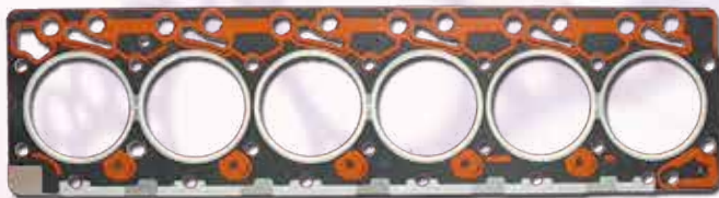
《 S6D102 》