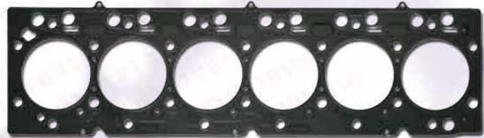
《 6D107 》