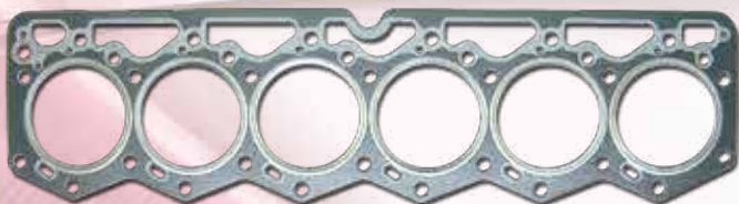
《 S6D105 》