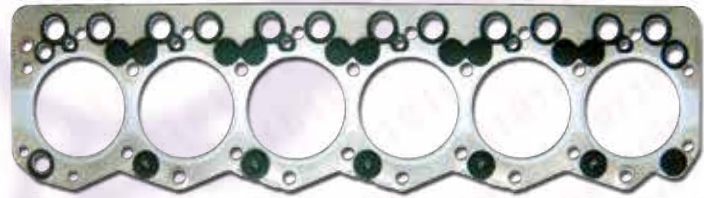
《 S6D108 》