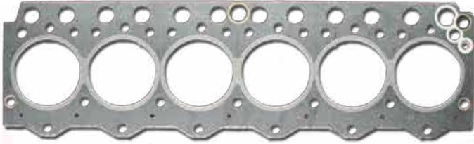
《 S6D95 》