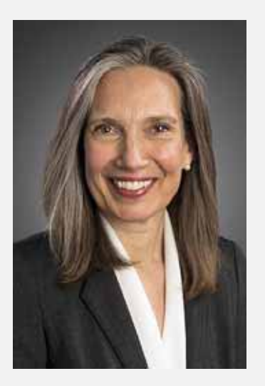
33 South Sixth Street Suite 4900 Minneapolis, Minnesota