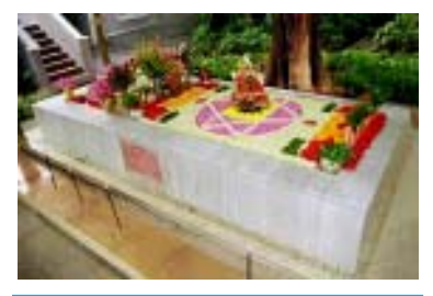
Samadhi at Pondicherry Ashram

To Thee who hast been the material envelop of our Master, to Thee our infinite gratitude. Before Thee who hast done so much for us, who hast worked, struggled, suffered, hoped, endured so much, before Thee who hast willed all, attempted all, prepared, achieved all for us, before Thee we bow down and implore that we may never forget, even for a moment, all we owe to Thee.