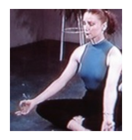
May the longtime sunshine upon you all Love surround you and the Pure Light within you guide your way on...

15. MEDITATE (establish yourself in your your own infinity...) (5-10 min.)