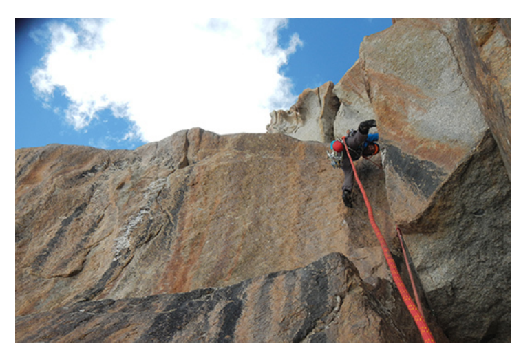
The first 5.12a crux on Sal con Cebolla, Kyzyl Asker.