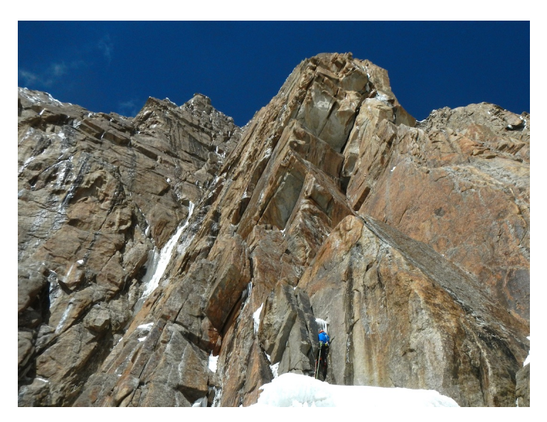
Approching the roofs.