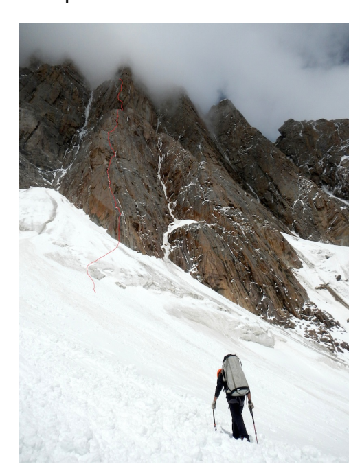
Snow slopes and the lower part of the route marked.