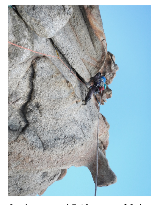
On the second 5.12a crux of Sal con Cebolla.