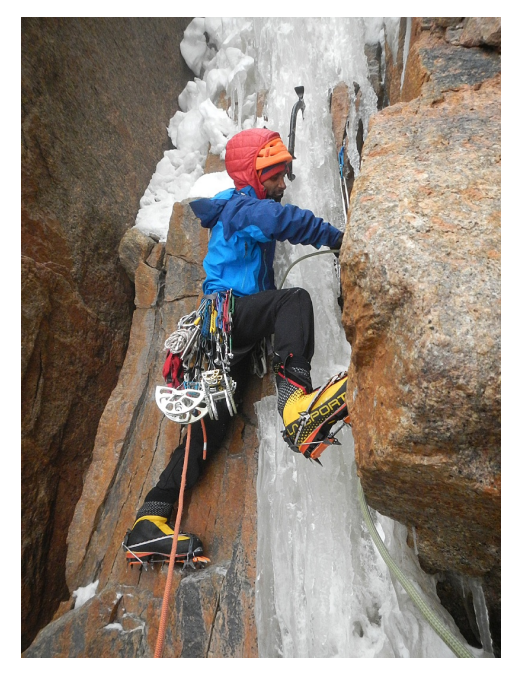
Close to the crest of the northeast ridge on Sal con Cebolla.