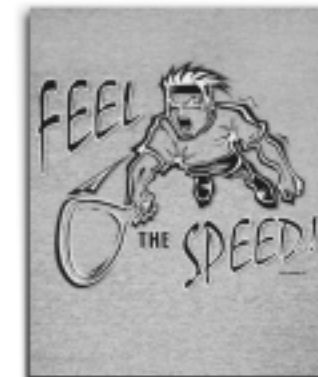
ITEM E - FEEL SPEED TAN OR GREY M,L,XL $15 FRONT: SPEED LOGO