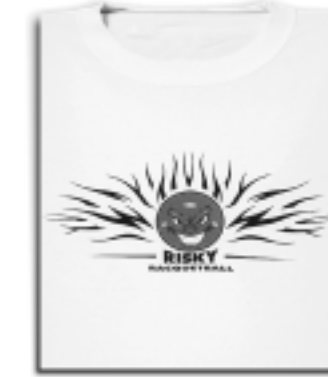
ITEM F - TRIBAL BALL WHITE M,L,XL $15 DESIGN IS FRONT