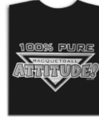
ITEM I - ATTITUDE BLACK M,L,XL $15 FRONT: ATTITUDE LOGO