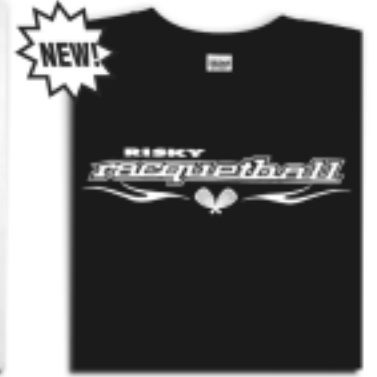
ITEM H - RISKY RACQ. BLACK M,L,XL $15 DESIGN IS FRONT