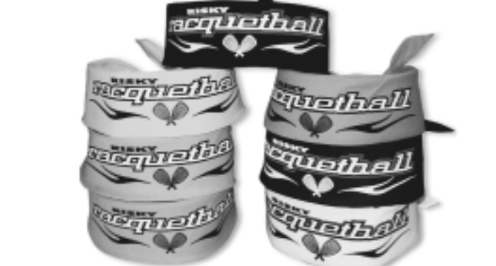
ITEM K - BANDANAS $6.00 OR 3 FOR $15.00 BLACK, WHITE, NAVY, YELLOW, GREY, GOLD, SKY BLUE, TURQUOISE AND BEIGE.