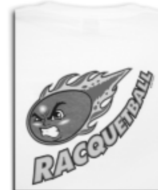
ITEM A - BALL WHITE M,L,XL $15 FRONT: RISKY LOGO

CHECK US OUT ON THE WEB! RISKYDESIGNS.COM