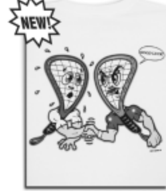
ITEM J - GOOD LUCK! WHITE M,L,XL $15 FRONT: RISKY LOGO