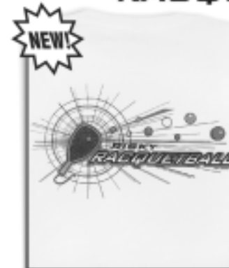
ITEM B - FUTURISTIC WHITE M,L,XL $15 FRONT: RISKY LOGO