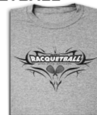
ITEM C - TRIBAL GREY M,L,XL $15 DESIGN IS FRONT