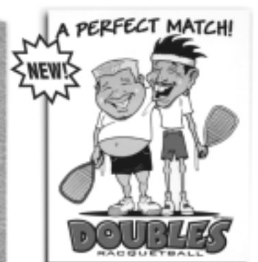
ITEM D - DOUBLES WHITE M,L,XL $15 FRONT: RISKY LOGO