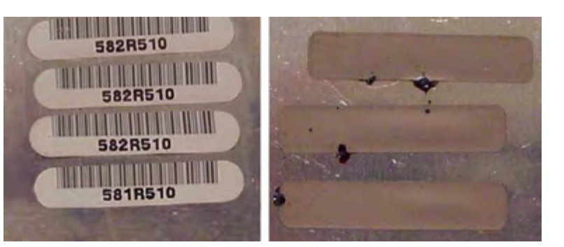
After Testing Results: New generation Polyimide Label (left) vs Standard Polyimide (right)

Shown here are the effects of time and temperature 315°/600° F for 50 minutes) on a standard polyimide labels compared to a new generation lead free polyimide labels. This new polyimide material is designed for the higher temperatures required for the lead free soldering processes.