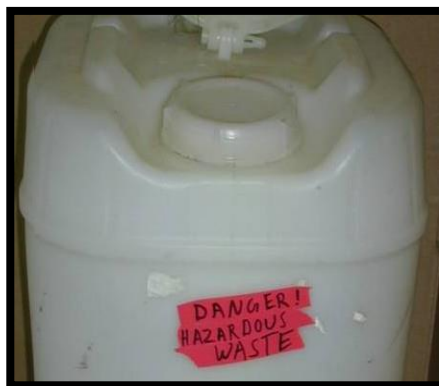
Poorly labeled container