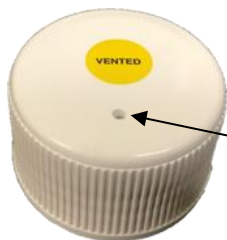
Cap with vented opening

All gas producing wastes must be stored in poly containers that have special vented caps. These containers with vented caps are available from EHRS and can be ordered online from our website . Glass containers must never be used for any gas producing waste streams due to the risk of explosion from over pressurization.