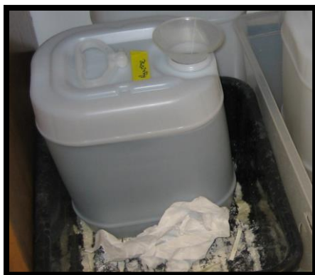
Open Container with funnel

Missing or incomplete labels and open containers are two of the most common violations found in research laboratories. Waste containers must be kept closed at all times except when waste is being added. All containers must be labeled with a properly completed chemical waste label.