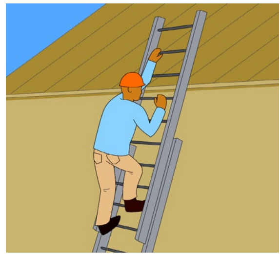
Figure 2 : Ladder extending three feet above the landing area.