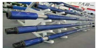
Hydraulic Jar Pipe