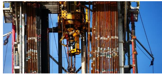
Drilling Pipe In Derrick