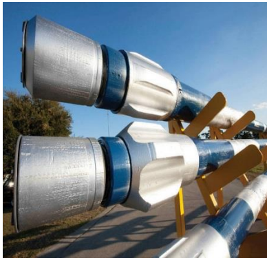
Downhole Motor PDM

The positive displacement motor (PDM) has been used in directional drilling now for several years and is a key component in bottom hole drilling assemblies. These downhole drilling motors, coupled with Measurements While Drilling (MWD) tools and proper stabilization allow directional wells to be drilled with one bottom hole assembly, eliminating costly multiple drill string tripping, which in the past was necessary for surveying, hole corrections, and stabilized assemblies.