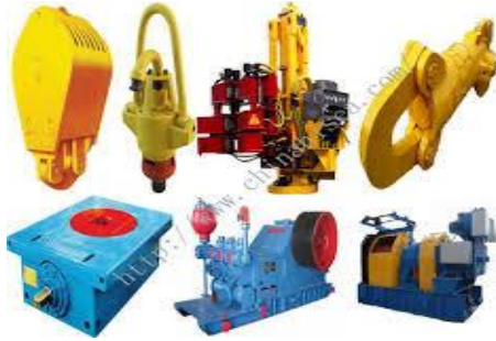
Some of Drilling Rigs Components