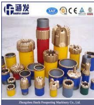
A set of PDC Bits

TSP: Thermally stable Polly crystalline.