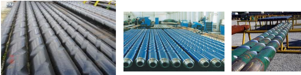
Drill Collars with Different Diameters

A drill collar is a large-diameter, heavy pipe used in oil drilling that fits around the drill string and puts weight on the drill bit and it's is the most widely used equipment after drilling pipes which have a very important role in well drilling, Because of high weight, It increases weight and drilling speed. These are available is sizes of: 3\frac{1}{2} , 8\frac{1}{2} , 9,11,13 inch and should be available on the rig.