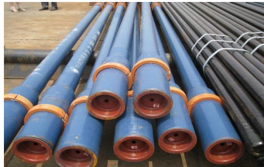
Heavy Weight Drill Pipe With Different Diameter