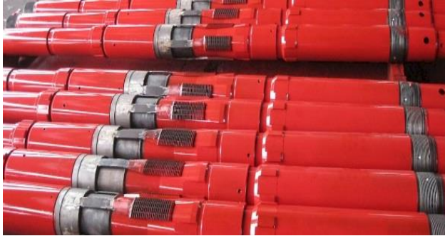
Liner Hanger Packer