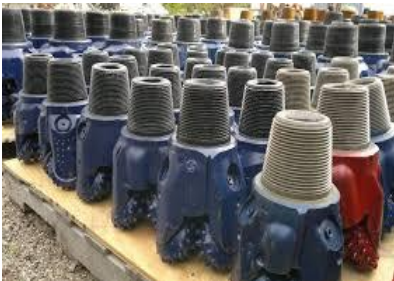
Rock Bit tri-cone

◆ Rock Bits: Tooth insert Bits: these bits sizes usually are available from 8\frac{1}{2} to 30 inch.