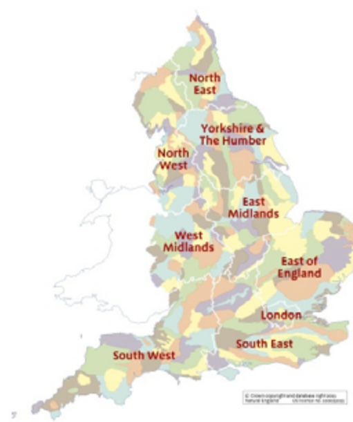
National Character Areas map

NCAs are already being used for a wide range of purposes which include: