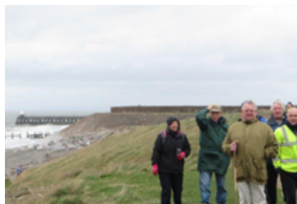
CLAF members take a blustery walk along the England Coast Path at Maryport.

LAF members provided personal views and feedback from their own experiences of walking along that section of coast at the start of the process, which helped Natural England identify specific issues and opportunities. During the planning process LAF members helped to identify landowners when more information was needed and continued to advise on progress in advance of the report to the Secretary of State.