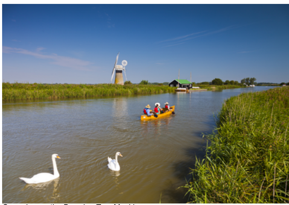
Canoeing on the Broads - Tom Mackie

The trails cover the more tranquil reaches of the river system