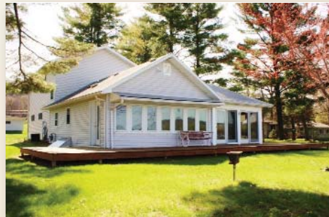
STUNNING VIEWS • LAKE WISCONSIN

W11619 Demyneck Rd., Lodi, WI 3 bd, 2 bath - 1,767 sqft. 100 ft. of lake frontage on double lot Amazing views across Lake Wisconsin MLS# 1755324 - $469,900