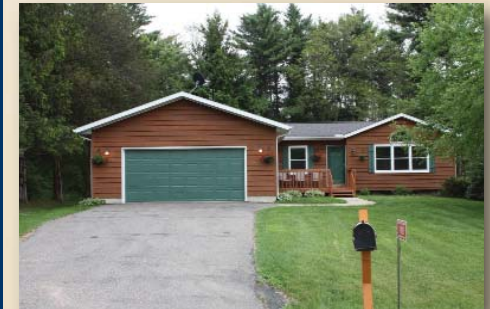
RUSTIC CHARM • WISCONSIN RIVER

W11680 County Road, Lodi, WI 3 bd, 1 bath - 1,260 sq. ft. Zoned for commercial and residential 91 ft. of lake frontage, 1.22 acres MLS# 1740019 - $379,900