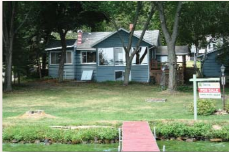
CUTE AND CHARMING • LAKE WISCONSIN

N3269 Tipperary Point Rd. 4 bd, 3 bath - 3,325 sq. ft. Open floor plan, amazing master suite Extra land available MLS# 1726518 - $599,900