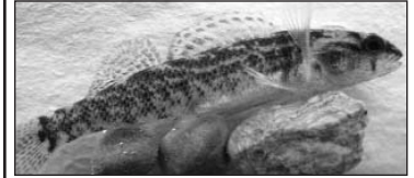
Mud Darter, a special concern fish species found during the first year of near fish surveys completed on Lake Wisconsin.