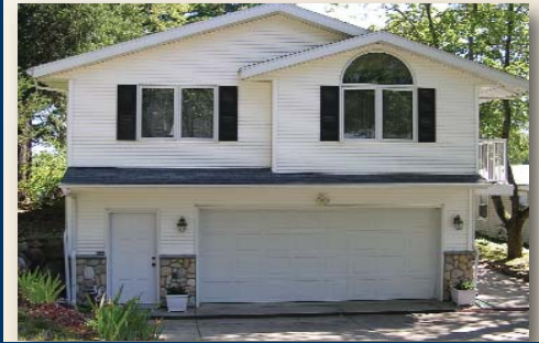
GORGEOUS HOME • LAKE WISCONSIN

N2421 Rapp Rd., Lodi, WI 3 bd, 2 bath - 1,650 sq. ft., 60 ft. of lake frontage Only 30 minutes from downtown Madison Adjacent lot available MLS# 1706998 - $450,000