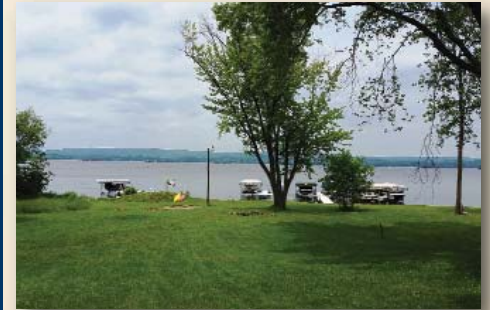
UNIQUE OPPORTUNITY • LAKE WISCONSIN

W11593 Demyneck Road, Lodi, WI 4 bd, 2 bath - 2,965 sq. ft. Open concept kitchen with lakeviews 50 ft. of lake frontage MLS# 1726744 - $422,900