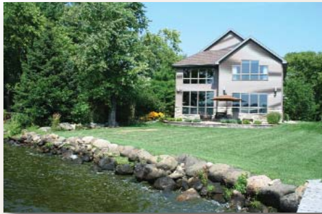
MESMERIZING LAKE VIEWS • LAKE WISCONSIN

N3269 Tipperary Point Rd. 4 bd, 3 bath - 3,325 sq. ft. Open floor plan, amazing master suite Extra land available MLS# 1726518 - $599,900