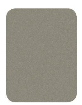
Autumn Perle #