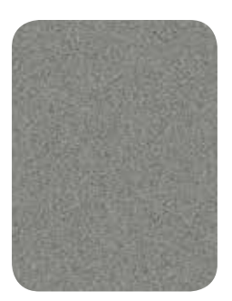
Nimbus Metallic #