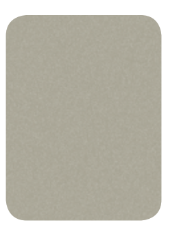
Smoked Silver Perle #