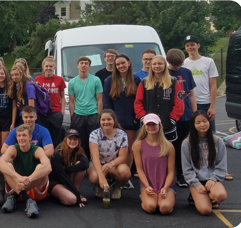
to their respective camps in South Carolina, Georgia, and Toronto.

Along with the general code camp, many of our teen volunteers helped the congregation by renovating a daycare room, filing paperwork, and organizing different areas in the church. Although serving at this sister congregation was the purpose of the mission trip, the teens and chaperones also experienced several memorable activities, like exploring the city of Atlanta and enjoying a wonderful day at Stone Mountain Park. These opportunities helped to rekindle friendships and to strengthen the Christian bond of fellowship. Whether it was helping the campers learn code or refurbishing the church’s nursery, these members of St. John’s youth group were able to use the various gifts with which God has blessed them in faithful stewardship.