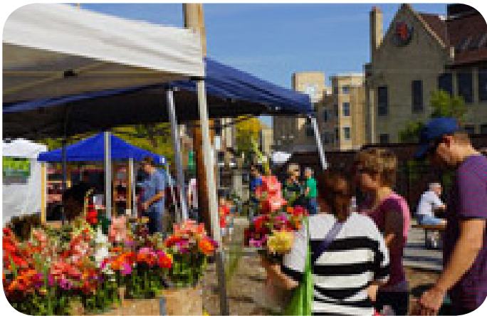
Tosa Farmers Market

During the summer, church and school volunteers handed out St. John's monogrammed shopping bags in front of our school to attendees of the Tosa Farmers Market. Our playground was also open to the community, and free lemonade was available. Over two Saturday mornings, about 600 bags were distributed to community members. A number of families stopped by to use the playground and talk with our volunteers. Not only were these positive contacts made with community members, but the St. John's bags will serve as silent promotion in our community this fall. One more Farmers Market event is being planned in conjunction with our school's Fall Festival.