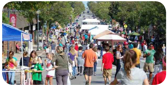
Chili'n on the Ave

St. John's once again manned a booth at the Tosa Night Out festival on August 4. Due to construction in the Tosa Village, this year's event was again held at the Milwaukee County Zoo. The St. John's booth distributed promotional material and flyers, talked to dozens of families, and served as the "glow stick stop" on the annual flashlight walk.