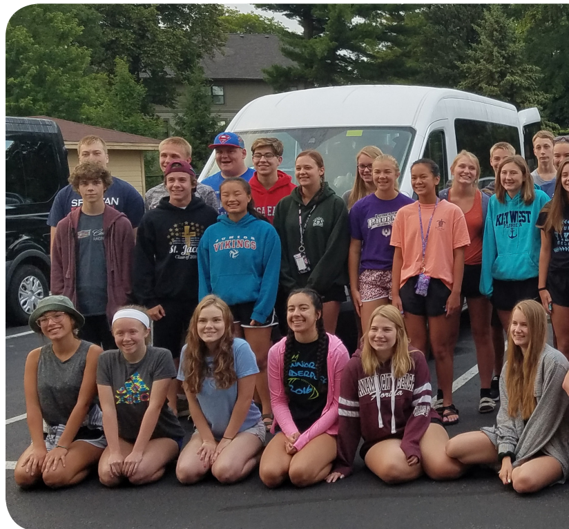
The entire youth mission team just before they split up and headed off

Our trip back home included a stop overnight at Beautiful Savior in Cincinnati, Ohio. I think I can speak for all of us on the trip when I say a huge thank you to both Illumine and Beautiful Savior for their warm and generous hospitality. I loved working with the kids and spreading God's message. I look forward to more trips.