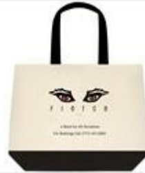
Two Tone Fierce Tote Bag, $20