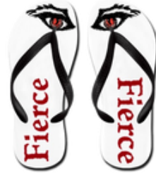
Fierce Flip Flops, $15