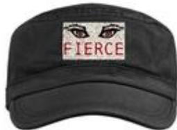
Black Cadet Hat, $25