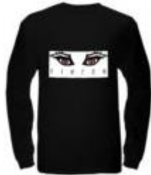
Black Long Sleeve T Shirt, $25