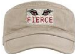
Mocha Cadet Hat, $25