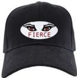
Black Ball Cap, $18