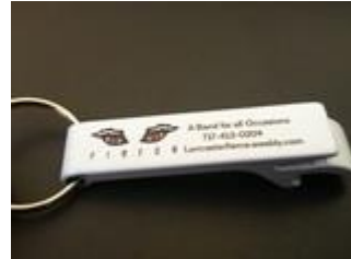
Fierce Keychain Bottle Opener, $4