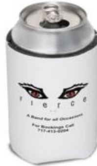
Bottle or Can Cozie, $4