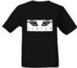
Black Short Sleeve T Shirt, $20