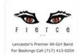
Fierce Magnet, $3