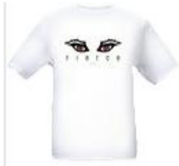
White Short Sleeve T Shirt, $20