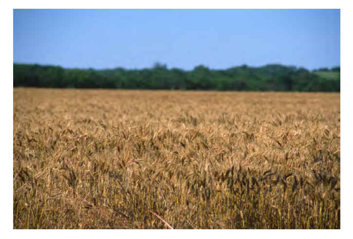
Figure 2. Wheat field near Jasper, Missouri (U.S. Geological Survey, 2006).

(fig. 2). According to the U.S. Department of Agriculture's National Agricultural Statistics Service (NASS), a majority of the Iowa counties in this ecoregion have at least 50 percent of their land in farms as cropland. To the southwest, the primary crops during the study period in the Kansas counties of the ecoregion were wheat, corn, and sorghum while the counties in Oklahoma harvested mostly wheat and soybeans (U.S. Department of Agriculture Kansas National Agricultural Statistics Service, 2009c and U.S. Department of Agriculture Oklahoma National Agricultural Statistics Service, 2009e).