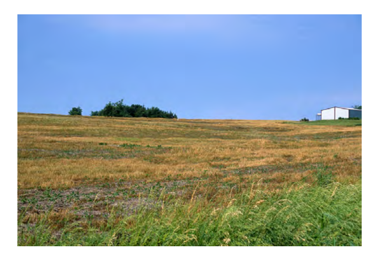
Figure 3. No-till farming near Hamilton, Missouri (U.S. Geological Survey, 2006).

The devastation of cropland that was associated with the Great Flood of 1993 had an affect on land use in the Central Irregular Plains. Specifically, greater than 61 centimeters (cm) of rain fell on central and northeastern Kansas, northern and central Missouri, most of Iowa, southern Minnesota, and southeastern Nebraska, and as much as 97 cm fell in east-central Iowa (Johnson and others, 2004). These amounts were approximately 2003 to 50 percent greater than normal (Johnson and others, 2004). From April 1 to August 31, precipitation amounts approached 122 cm in east-central Iowa, easily sur-