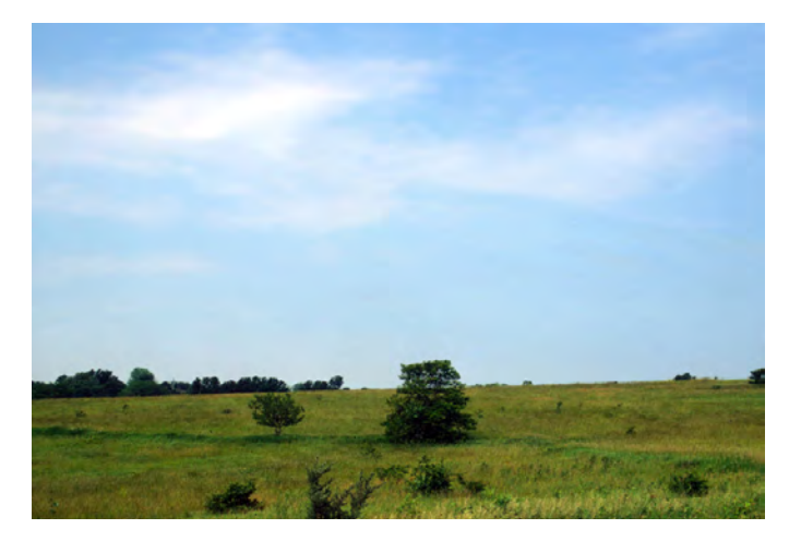
Figure 4. Conservation Reserve Program land near Graysville, Missouri.

The U.S. Department of Agriculture NASS CRP annual cumulative enrollment statistics show that overall, acres enrolled in the CRP in the ecoregion declined slightly in the later portion of the study period (fig. 4). While that may have had a significant affect on the land-change conversion from agriculture to grassland/shrubland, other factors such as economics and climate also should be considered.