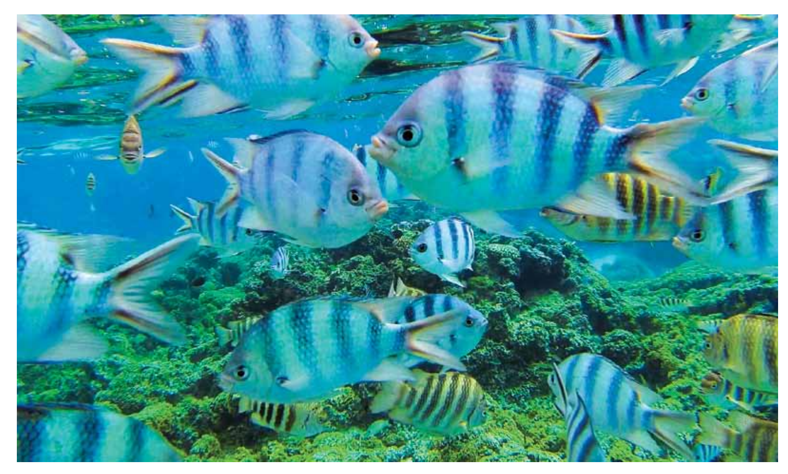
ABOVE: Schools of reef fish, like these Sergeant Majors, are plentiful in the waters around Bora Bora. RIGHT: Outrigger canoe racing is a popular sport in Polynesia. Here, a young man surfs the wake behind one of the Paul Gauguin's tenders.

in earlier times, outrigger canoes were made, provided vivid descriptions of the rituals of ancient Polynesians and took us to recently excavated maraes.