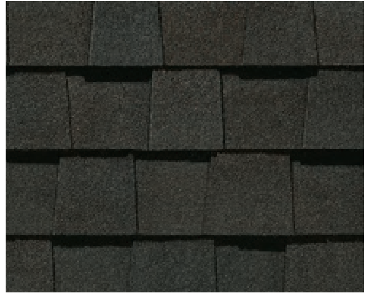
Max Def Black Walnut