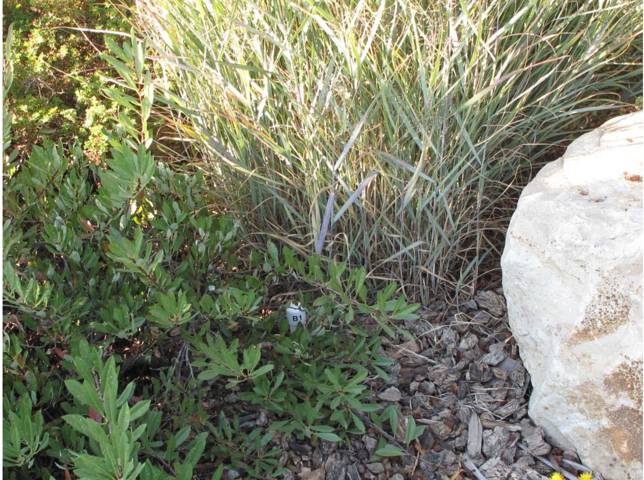
Figure 1. Location of B1 MoisturePoint sensor. The plant complex consists of Pawnee Buttes Sandcherry ( Prunus besseyi 'Pawnee Buttes') in the foreground, Dakota Sunspot Potentilla ( Potentilla fruticosa 'Fargo'), just above the Sand Cherry in the photo, and Prairie Sky Switchgrass ( Panicum virgatum 'Prairie Sky', just behind the white sensor cap.