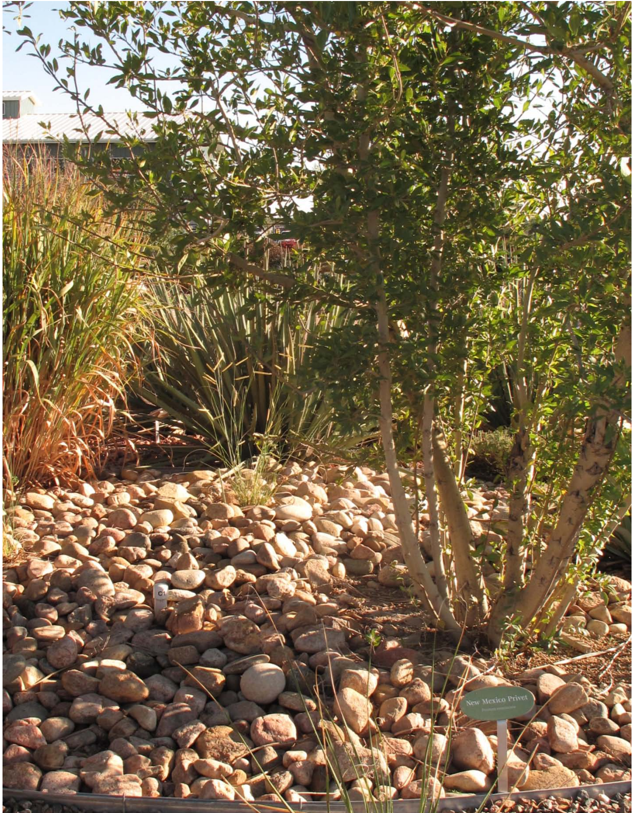
Figure 2. Location of C1 MoisturePoint sensor. The plant complex consists of New Mexico Privet ( Forestiera neomexicana ). Note the white sensor cap in the lower left third of the photo.