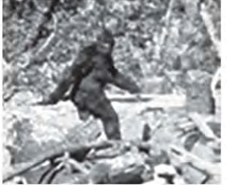
Although this photo was taken in California during the 1960s, Bigfoot claims he has permanently moved to Michigan to fulfill his dream of seeking a pleasant peninsula.

"Oh yeah," he said. "I also look really good in a three-piece suit." ■