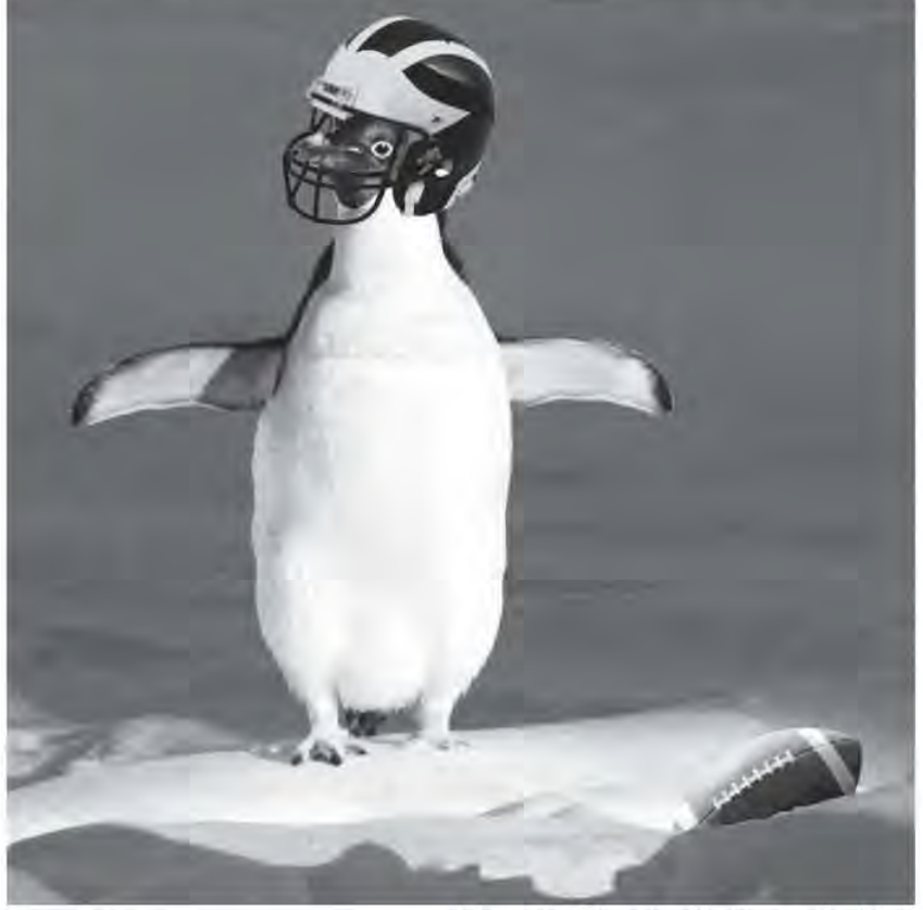
Arbaugh: Give The Big House the bird.

Big Ten officials were perplexed about Arbaugh's recruiting venture into Antarctica. Said one: "We don't want to be accused of being anti-penguin, but I don't know if we can find shoes that wide or helmets that small to fit them."