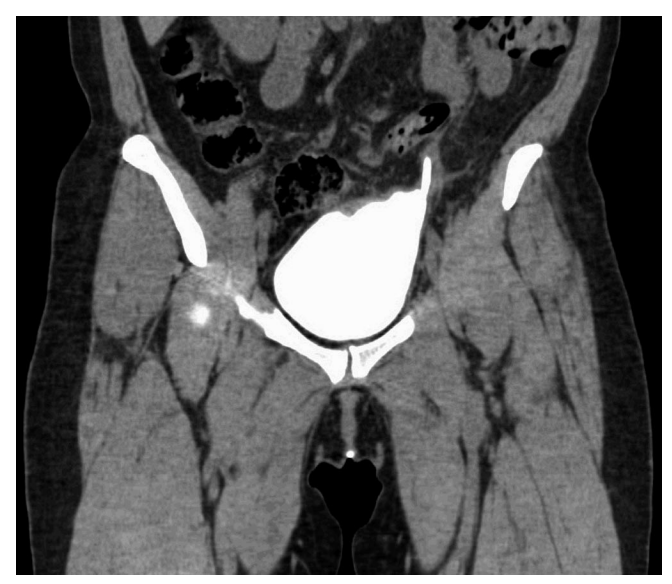
Figure 4. Postoperative aspect of CT cystogram after psoas hitch with low-grade reflux.

Unfortunately, our patients were diagnosed after the hysterectomy. Five patients had the repair within 30 d of injury, showing that early repair is feasible and efficient