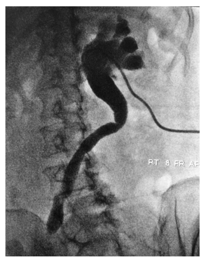
Figure 3. Intraoperative pyelogram of ureter deviated past mid-sagittal plane.