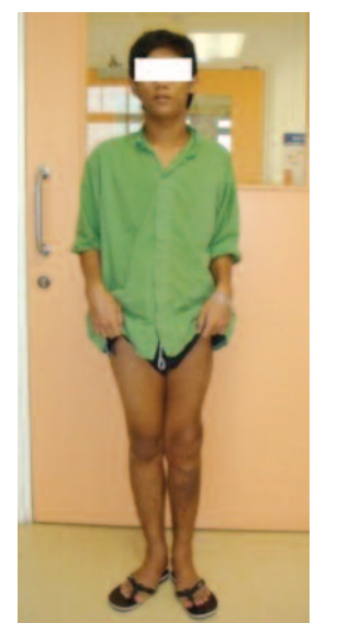
Fig. 1g: Patient standing at 56 Fig. 1h: Full knee extension. months. He has a mild Trendelenburg gait