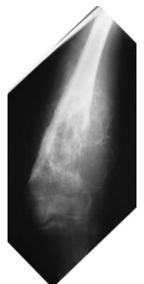
Fig. 1b: Plain x-rays at presentation.