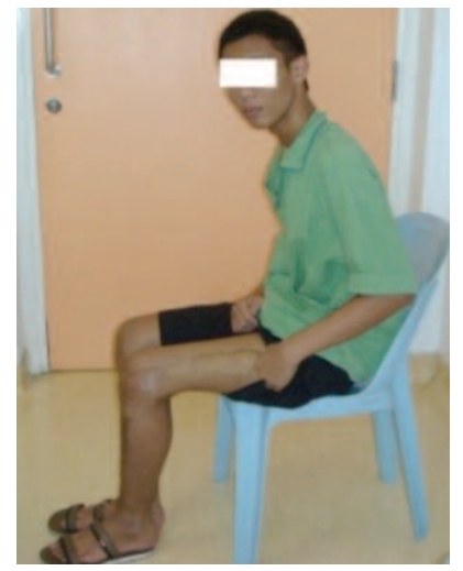
Fig. 1i: 90 degrees of knee flexion.