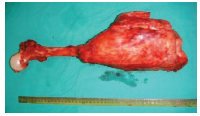
Fig. 1d: Tumour with femur excised.