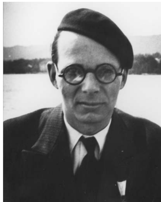
Figure 1.5 Ahlfors was fond of berets.