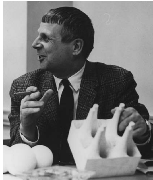
Figure 1.11 A cigar and a mathematical model—a delightful pairing.

Ahlfors: I wouldn't say that. I think that mathematicians are very nice people on the