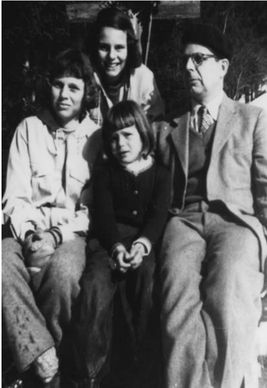
Figure 1.8 Ahlfors with his three daughters in the Austrian Alps in the early fifties.