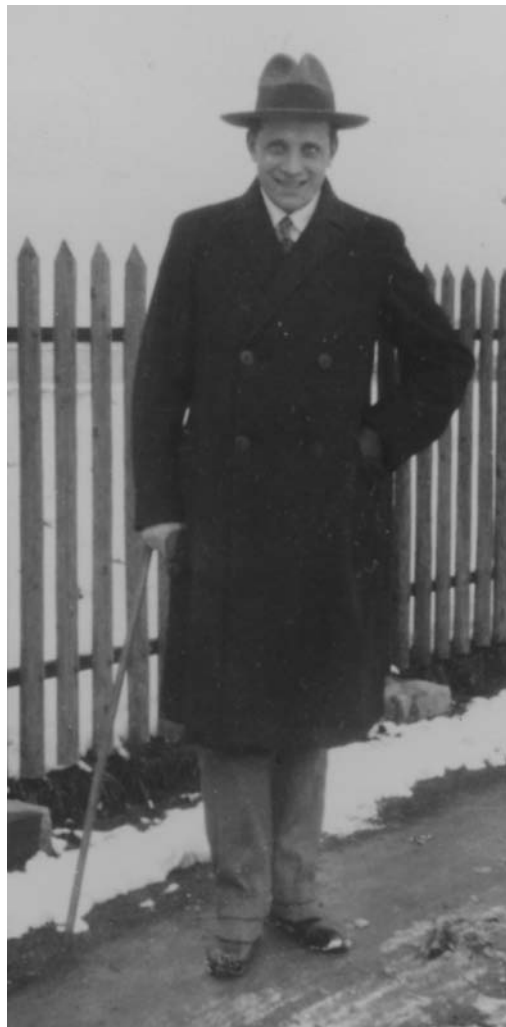
Figure 1.3 Rolf Nevanlinna, a great influence on Ahlfors.

Ahlfors: Yes. Pólya was perhaps the most interesting person at Zürich. He led the seminar, which of course was very good—but he had strange ways of doing it.