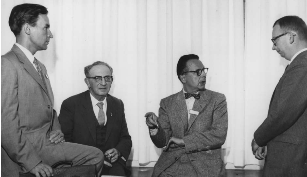
Figure 1.10 Ahlfors taking a break at a mathematics meeting.

everything in my system runs better! Sometimes, of course, when one gets an idea, it's not very good; but one has to take the bad with the good.