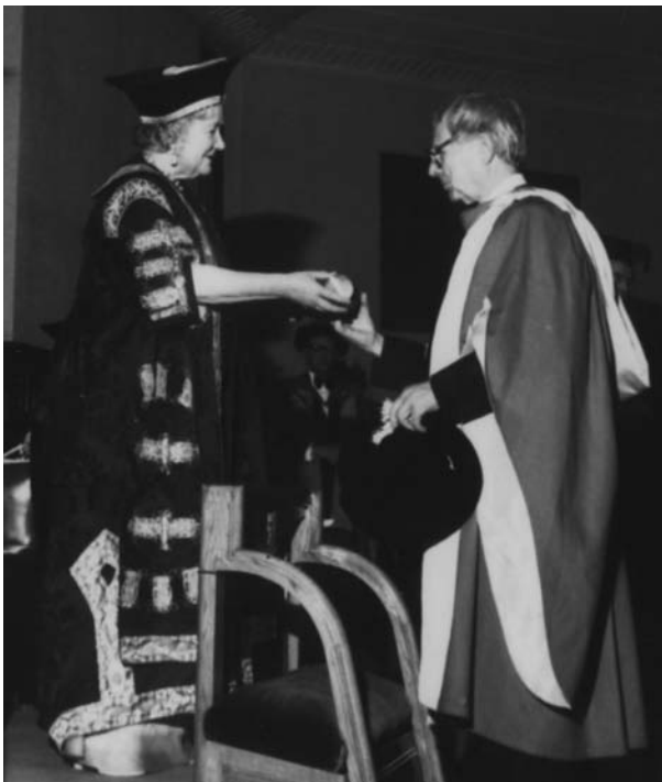
Figure 1.12 Ahlfors receiving an honorary degree from the English Queen Mother.

MP: Some of them do. How about John Wheeler, who lives just across the water from you? His work shows quite a bit of high-powered mathematics. There's also a great deal of mathematics used by string theorists.