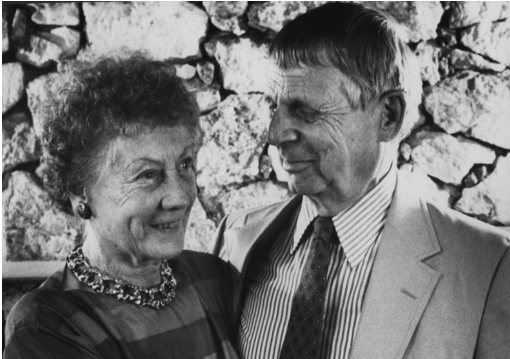
Figure 1.13 Ahlfors with his wife Erna in 1987.

thoughts most of the time? Is mathematics just bubbling up around here for you?