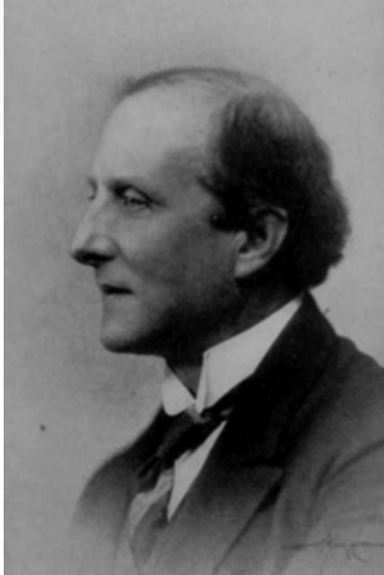
Figure 1.7 Constantin Carathéodory.