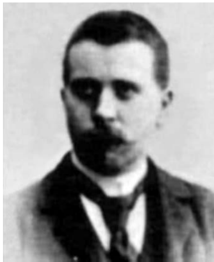
Figure 1.2 Ernst Lindelöf was the thesis advisor of both Ahlfors and Nevanlinna. Ahlfors dedicated his classic text, Complex Analysis , to him.

Ahlfors: Yes, Lindelöf—the father of mathematics in Finland. In the 1920s all Finnish mathematicians were his students. He was essentially self-taught.