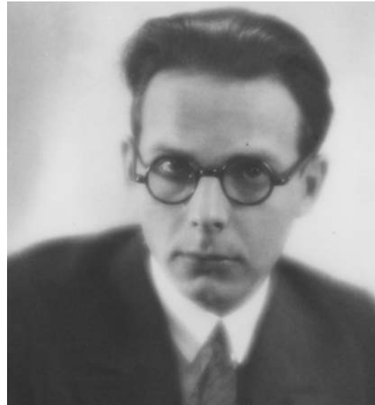
Figure 1.4 A young Ahlfors with a look of determination.

Ahlfors: Yes, I like to teach. It's not the same as doing mathematics; you have to think about the subject from a different angle. For