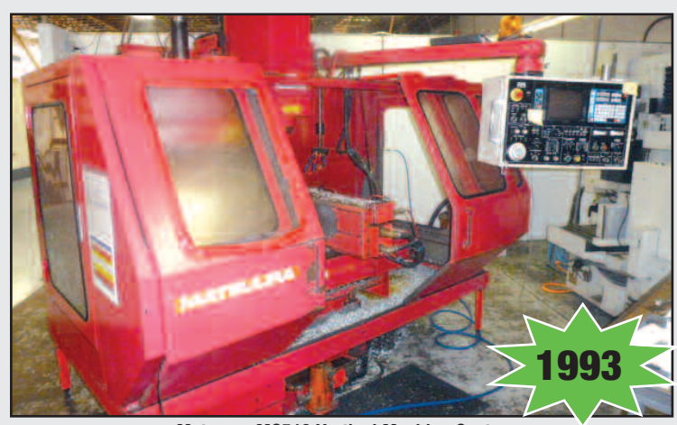
Matsuura MC510 Vertical Machine Center