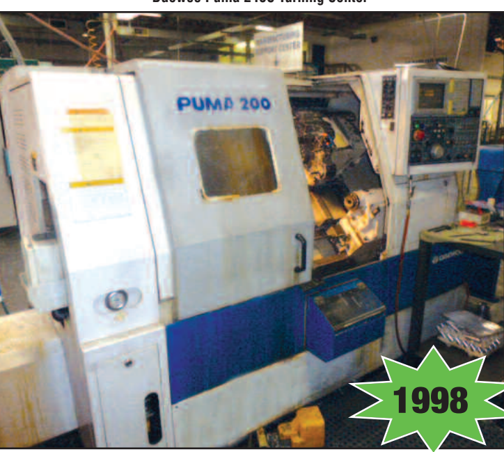
Daewoo Puma 200C Turning Center