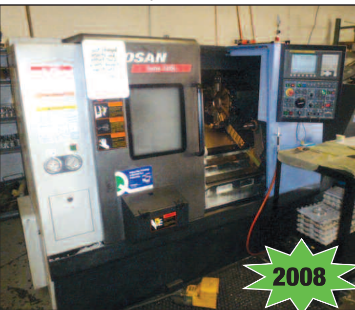
Daewoo Lynx 220L Turning Center