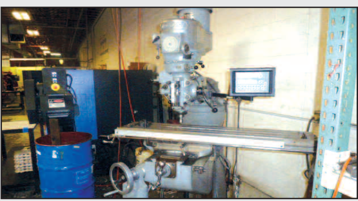
Bridgeport Vertical Mill