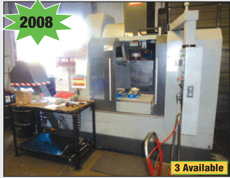
Yama Seiki VMB850 Vertical Machine Center