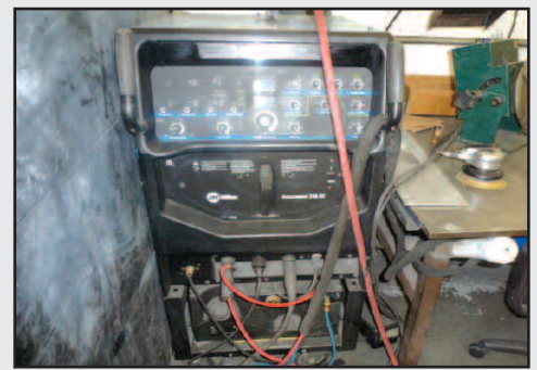
Miller Synchrowave 350 Welder