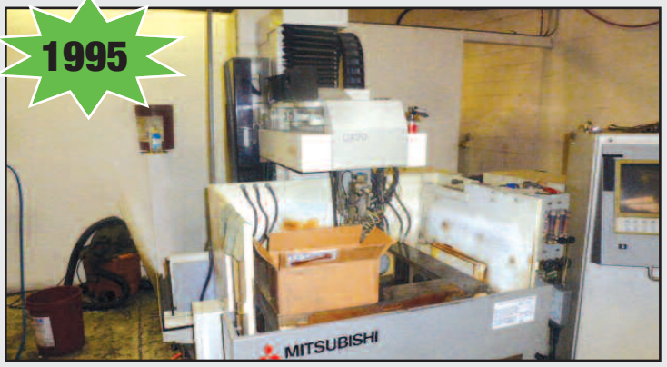
Mitsubishi CX20 CNC Wire EDM

Beta-Mig 250, 250 Amp Mig Welder; Ridgid Chop Saw; Miller Mod. Millermatic 212 Arc Welder; Accetylene Unit; Miller Mod. Synchrowave 350, 350 Amp Arc Welder; Miller Mod. Synchrowave 250 DX, 250 Amp Arc Welder; Miller Mod. Synchrowave 350LX, 350 Amp Arc Welder; Small Welding Positioner; (20) Sections Shelving; (6) Dbl. End Grinders; (6) Tombstones; Combo Disc/Belt Sander; (2) 20 Ton 'H' Frame Press; (3) Shop Vacuums; (30) Kurt Table Vises; 900lb. Die Lift; Jet Mod. HBS-916W, 9" Auto. Horiz. Band Saw. S/N 11063599; Jet Mod. JWBS-14CS, 14" Vertical Band Saw. S/N 91001795; (3) Step Ladders; Dbl. End Grinder; (3) Lista Tool Cabinets; (5) Chick Mod. RST1315 Tool Vises