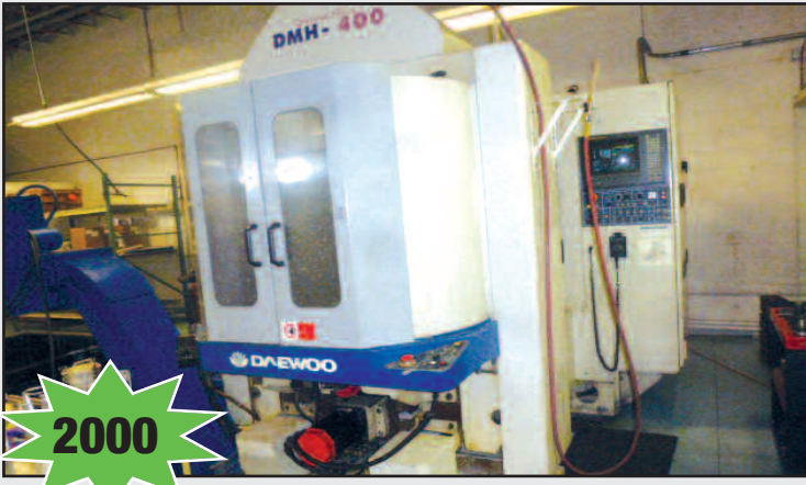
Daewoo CNC Horizontal Machine Center

(2000) Daewoo Mod. DMH-400, 4-Axis CNC Horizontal Machine Center w/ Fanuc 16M Controls, 16" Dual Shuttle Pallet System, Turbo Chip Conveyor, 60 Pos. ATC, INP Oil Hyd. Unit, 23" x 22" X 22" Travels. S/N AH45P-0112