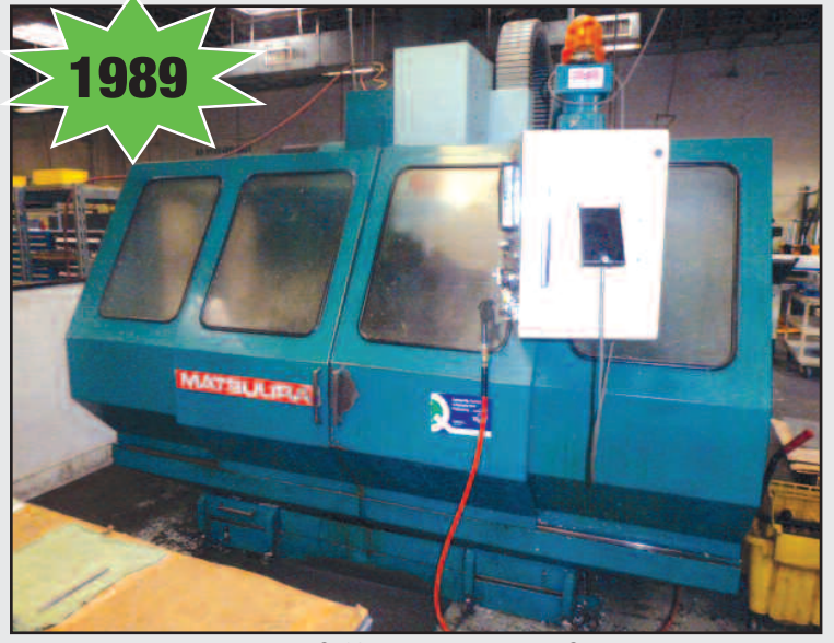
Matsuura MC760VX Vertical Machine Center

INSPECTION: Wednesday, June 3rd, 9am to 4pm & Morning of the Sale