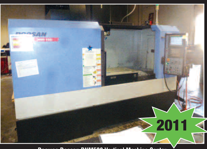
Daewoo Doosan DNM500 Vertical Machine Center

(19) CNC Turning & Machine Centers, CNC Fabricator & Press Brake