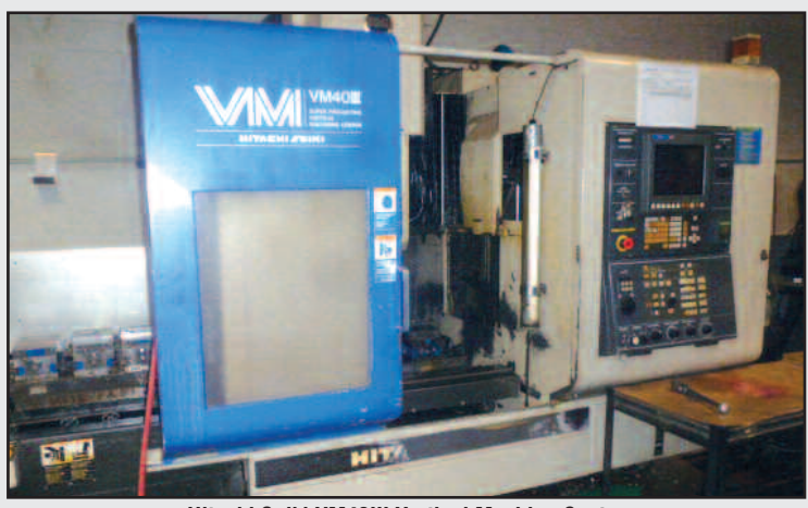
Hitachi Seiki VM40III Vertical Machine Center