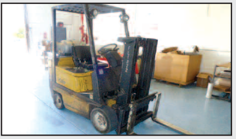
Yale 4000lb Forklift

Konica Minolta Mod. Biz Hub 200 Printer/Copier/Fax Machine; Dynex Monitor; Server Room