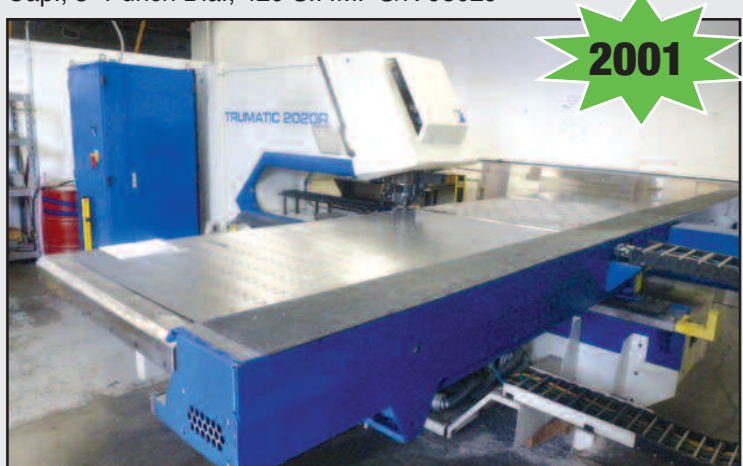
Trumpf 20 Ton CNC Plate Punch

(2001) Trumpf Mod. Trumatic 2020R, 20 Ton CNC Plate Punch, PLC Contolled, 100" x 50" Working Table, ¼" Sheet Thickness Cap., 3" Punch Dia., 420 S.P.M. S/N 98029