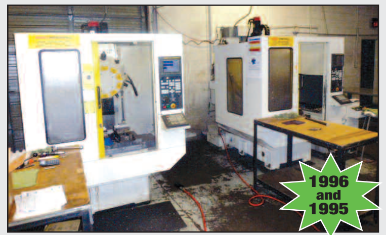
View of Fanuc Robodrill Drilling & Tapping Centers

(2) (1996 & 1995) Fanuc Robodrill Mod. T10C & T10B, CNC Drilling and Tapping Center w/ Fanuc 16M Controls, 10 Pos. Turret, 20" x 15" x 12" Travels. S/N n/a