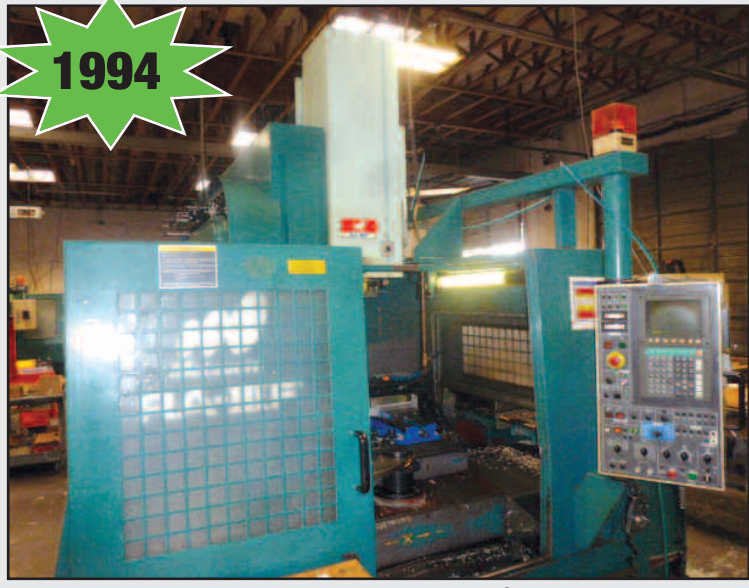
Matsuura RAIIIF Vertical Machine Center