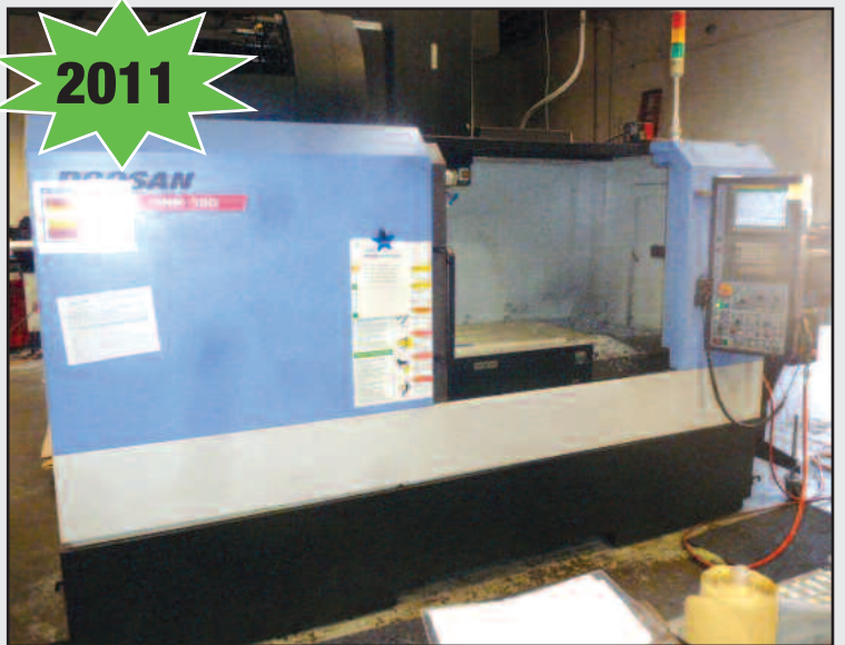
Daewoo Doosan DNM500 Vertical Machine Center