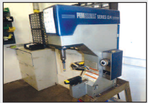
Pemserter Insertion Press