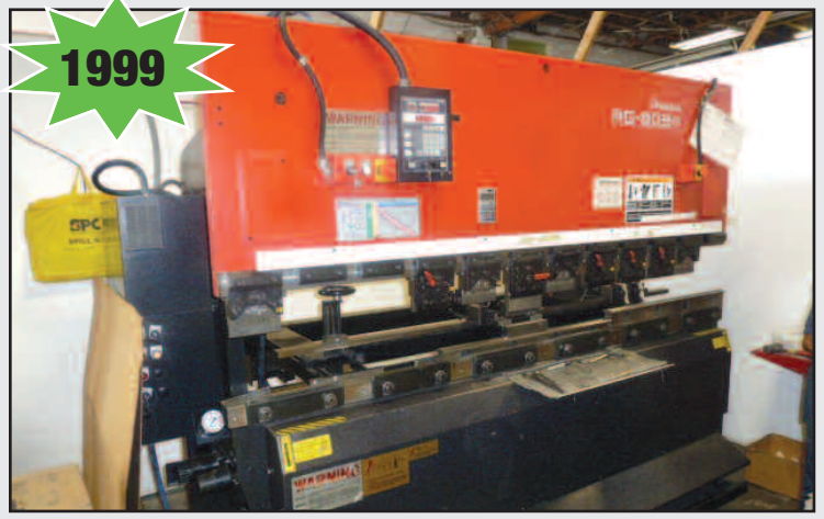
Amada 80 Ton Press Brake

(1999) Amada Mod. RG-8024LD, 8' x 80 Ton Hyd. Press Brake, Amada LD Controls, CNC Back Gauges, 15" Throat Depth, 4" Stroke w/ Spare Tooling. S/N 80240010