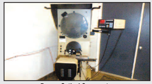
Dorsey Optical Comparator