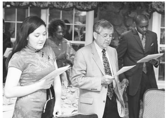
“God, You Made All Things for Singing”