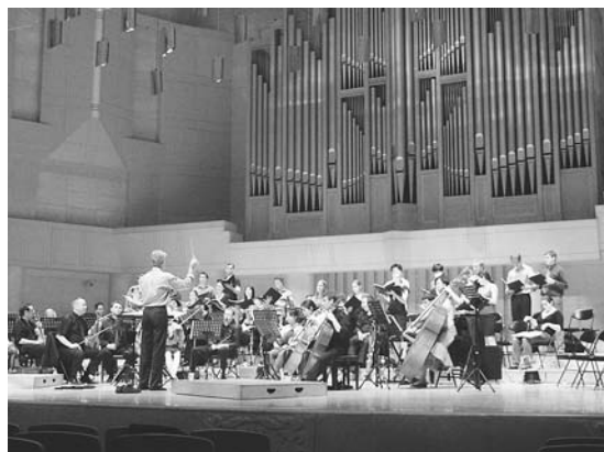
Schola performed at the Forbidden City Concert Hall in Beijing, and explored the Great Wall and Tiananmen Square.