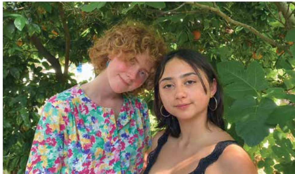
SUZANNE LACY & ANDREA BOWERS This Earth, What She is to Me , video, 3:36 duration, 2020.