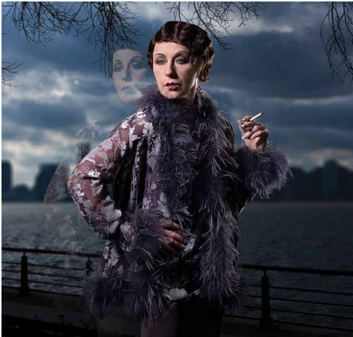
CINDY SHERMAN Untitled #566 , 2016, dye sublimation metal print, 48 x 50.5 inches; 121.9 x 128.3 cm.

Today, as we confront the alt-right conservatism ushered in by Donald Trump’s presidency, and his administration’s hostility to women’s and minority rights, these artists enthusiastically grab the torch that has passed down through 170 years of women’s struggle for equal rights.