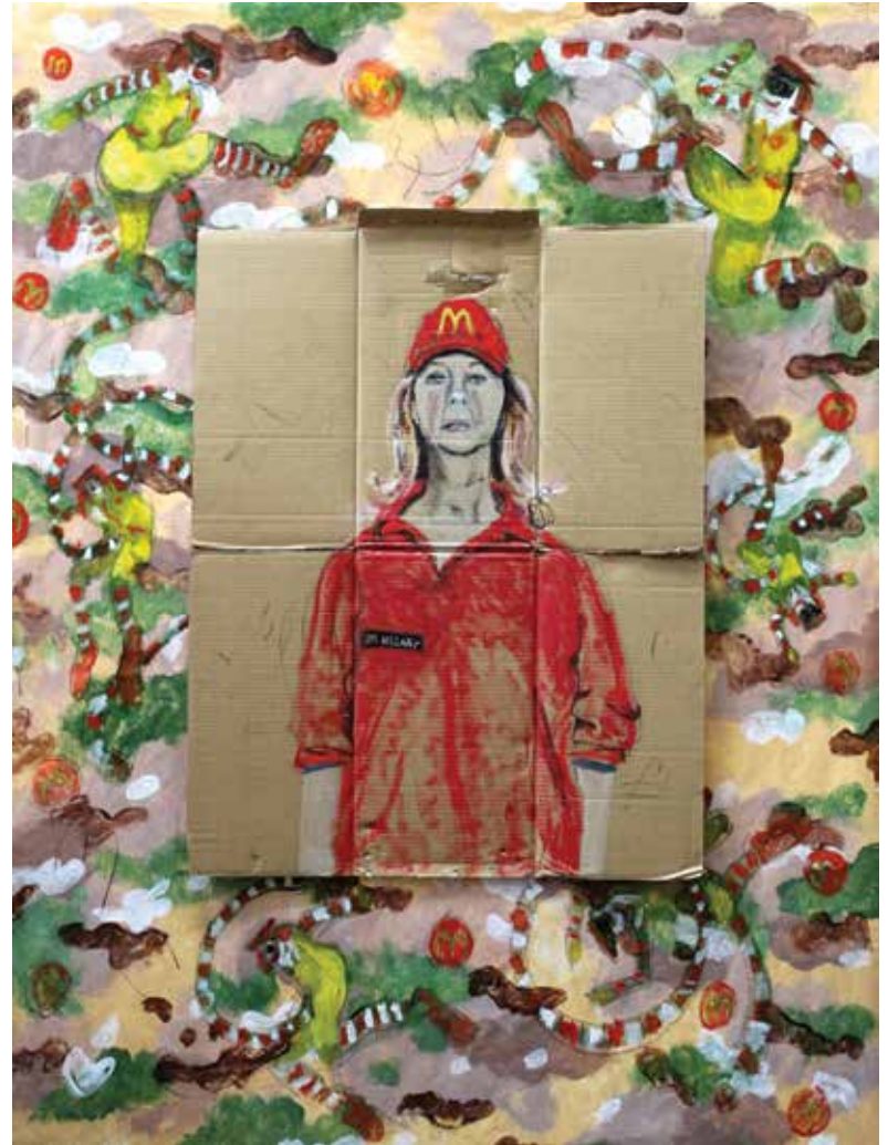
LAURA ELKINS I'm lovin' it! (Self as Hillary) , 2014, oil on cardboard mounted on acrylic on Tyvek, 83x62 inches.

The specific project determines the medium I use. I try to use materials, and painting support that evoke the content of the work. For instance, The Birth of Housework was painted on ironing boards, and The Children's Room was the home that sheltered my family as it expressed our life within it. The paintings on canvas in the many different series using self-portraits as First Ladies originated because the official portraits of First Ladies, which inspired the work, are easel paintings. The portraits in the America Povera paintings and The Pussy Paintings are on cardboard to reflect the perceived worthlessness of women in our culture. In the recent plein air self-portraits as Greta Thunberg, that address extreme climate, I used the elements of nature to help create the paintings – such as throwing a painting into the waves and dragging it along the beach, or holding a portrait under rainwater running off the roof of the house where I was staying.