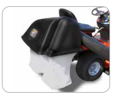
Twin Bag Collector Bag your clippings on a Side Discharge mower.