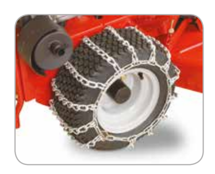
Tyre Chains For use on slippery surfaces like snow and ice.

Snowthrower Great for clearing paths through snow.