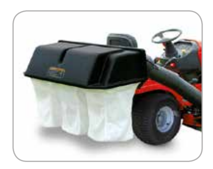
Triple Bag Collector Bag your clippings on a Side Discharge mower.