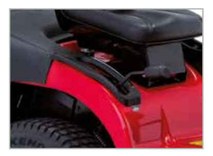
3,8 - 8,9 cm height-of-cut adjustable in 7 positions