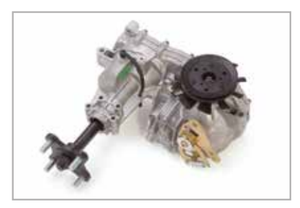
Hydro-Gear® hydrostatic transmission