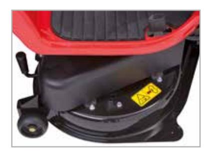
The rigid steel mowing deck houses two redesigned blades that offer top notch collecting performance.