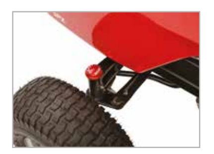
Durable pivoting cast-iron front axle

Briggs & Stratton Intek Series<sup>™</sup> 4175 with AVS<sup>®</sup> Mowing deck: 107 cm Fuel capacity: 13,2 litres Forward speed: o - 8,9 km/h Reverse speed: o - 4,8 km/h Tyres front/rear: 15" x 6" / 20" x 8" Dimensions (LxWxH): 182 x 88 x 114 cm Weight: 207 kg Warranty: 3-year limited