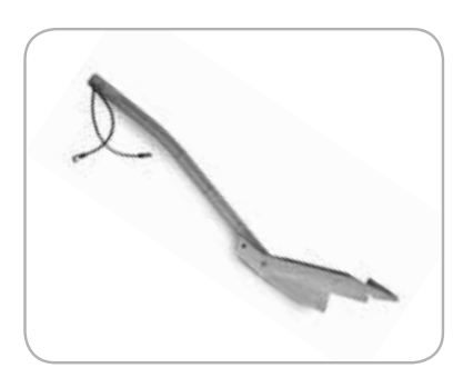
Mulch Plug Convert your Rear Discharge tractor to a mulching mower.