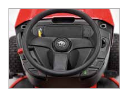
Ergonomically designed dash board