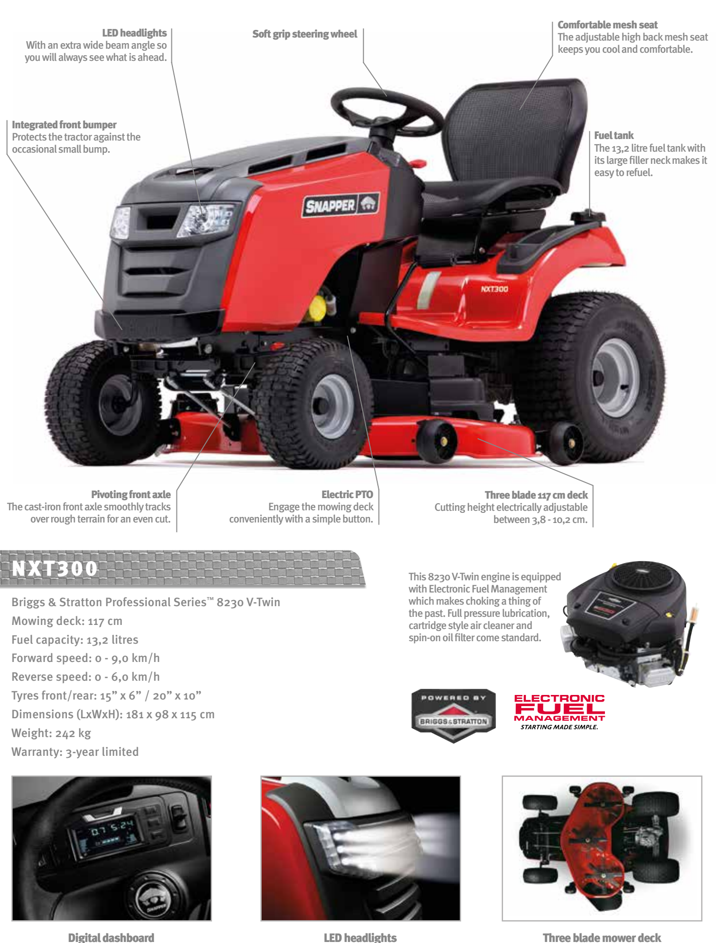
Three blade mower deck