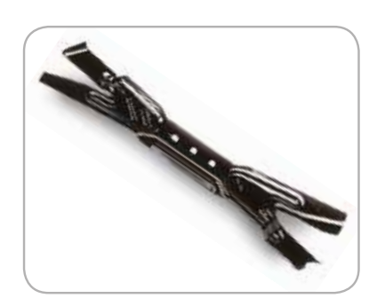
Ninja<sup>®</sup> Mulching Blade Improve your Rear Engine Rider's mulching performance to the max.