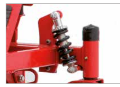
Front ride-dampening shocks

Briggs & Stratton Commercial Turf Series<sup>™</sup> 8270 V-Twin engine Mowing deck: 132 cm Fuel capacity: 24 litres Forward speed: o - 11,3 km/h Reverse speed: o - 8,o km/h Tyres front/rear: 11 x 4" / 20 x 8" Dimensions (LxWxH): 198 x 107 x 108 cm Weight: 315 kg Warranty: 3-year limited