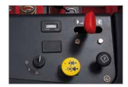
Easy to use controls

Briggs & Stratton's durable Commercial Turf Series<sup>™</sup> 8270 V-Twin engine features an integrated cyclonic airfilter, oil filter and pressure lubrication.