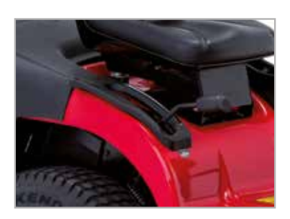
3,8 - 8,9 cm height-of-cut adjustable in 7 positions