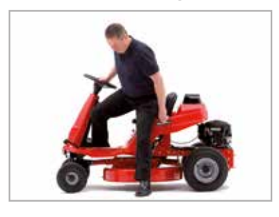
Step-through platform design