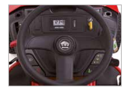
Mini Dash with hour meter, battery voltage and maintenance reminder