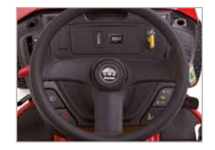
Ergonomically designed dash board with hour and fuel meter. cruise control