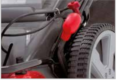
Centralized 6 position height-of-cut