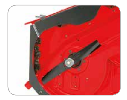
Mulching Kit Converts easily to a mulching deck.