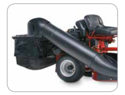
Single Bag Collector Accessible collection drawer with 175 litre capacity.