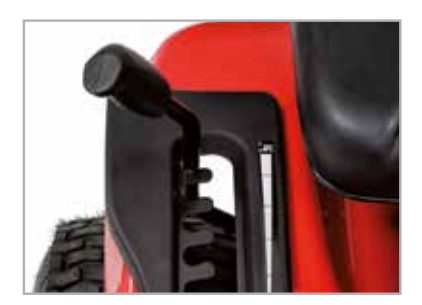
7 position height-of-cut