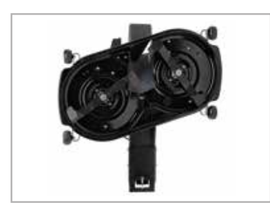
107 cm asymmetrical deck with redesigned blades