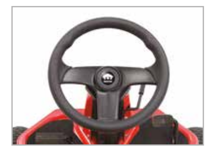
Soft touch steering wheel