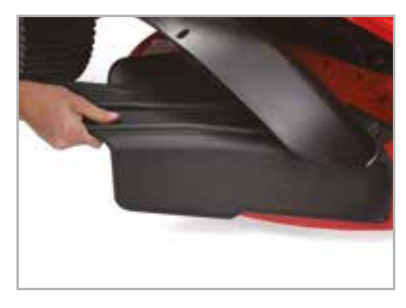
Toolless changeover from mulching to side discharge