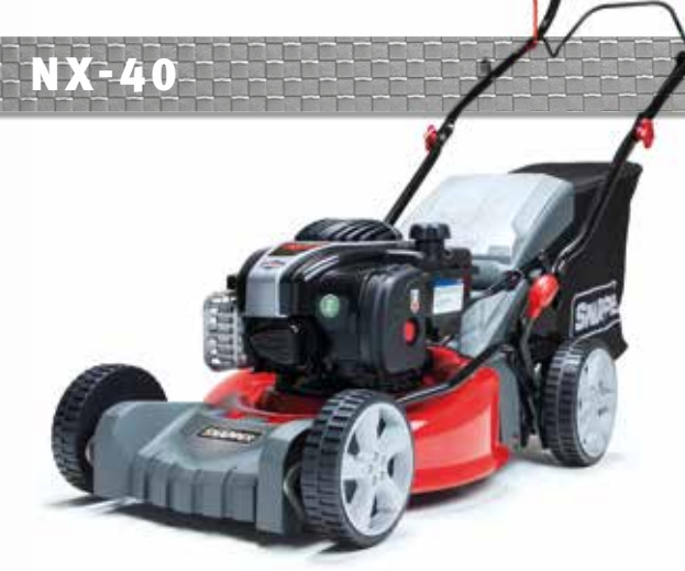
Briggs & Stratton 500E SERIES™ OHV Recoil Start Self propelled - single speed Bagging and rear discharge, mulching optional Cutting width: 42 cm Bag capacity: 60 litres 2-Year limited warranty

Briggs & Stratton 450E SERIES™ OHV Recoil start Push Bagging and rear discharge, mulching optional Cutting width: 42 cm Bag capacity: 60 litres 2-Year limited warranty