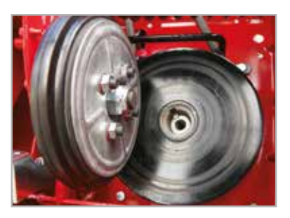
Variable speed disc drive transmission