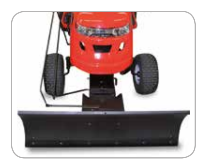
Snow Dozer Blade Great for clearing paths through snow.