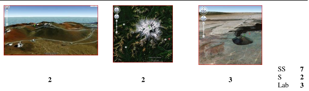
Student S122: "For this particular activity I found the aerial photographs with the oblique views to be very helpful, as well as interesting...these photographs are the next best thing to help me understand the overall shape and features that these specific volcanoes have"