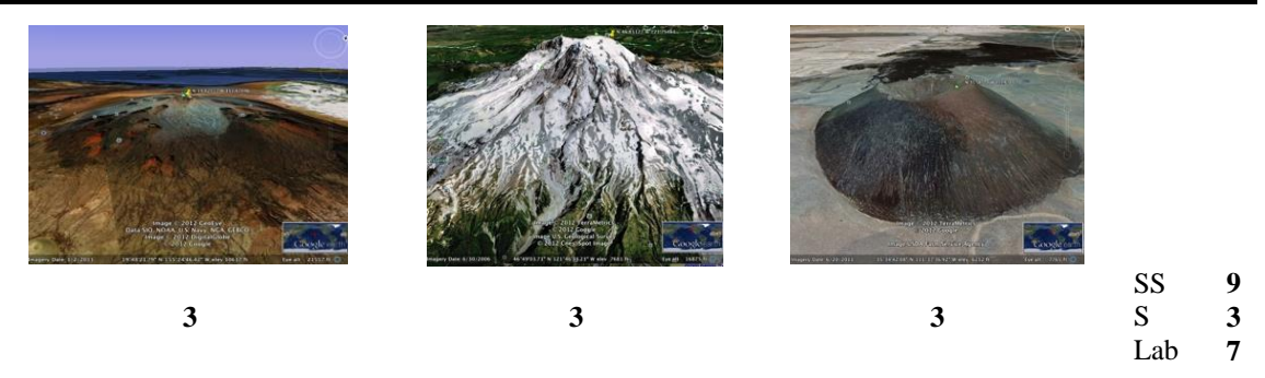
Student S80: "I absolutely love looking at the oblique view. They give me an actual feeling of the height of the volcanoes. I think that seeing them as if I were actually in front of them allows me to get a more real feel of the volcanoes."

Three students' screen shots identifying basic volcano types and their associated ordinal performance scores (0-3). Because the lab asked for three volcano screen shots, this particular task had a potential maximum score of 9, which could then be used to weight their written feedback. Total Lab SSS possible for the lab is 39 and serves as an overall performance indicator