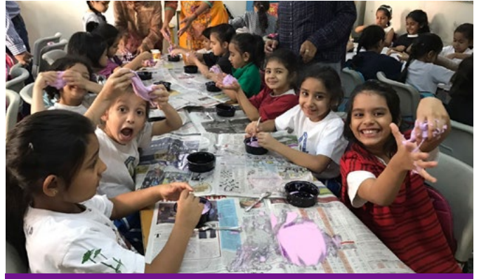
Made Slime, what fun!!!