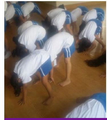
Inner Wellness through Yoga