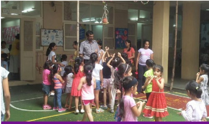
Govinda ala re ala