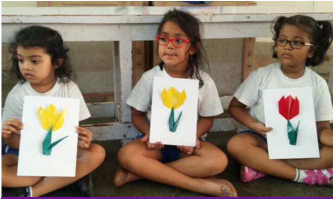
Learning about flowers through Origami