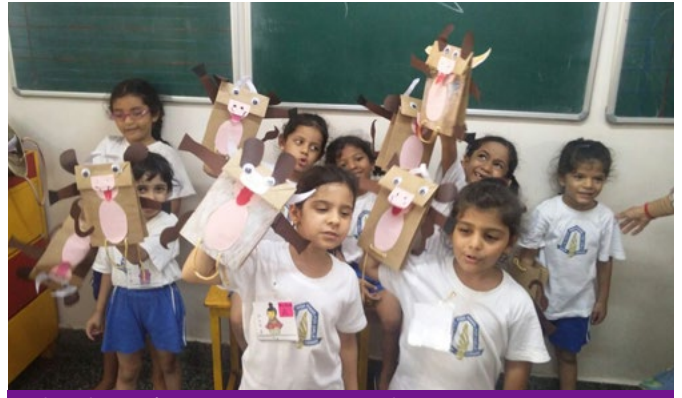
Role play with puppets, made by us.