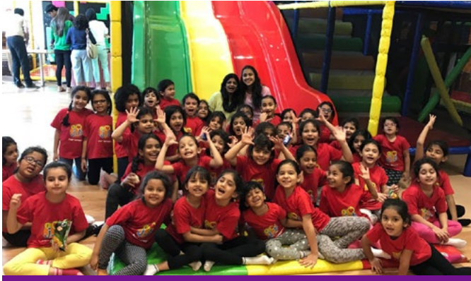
Fun times at Funky Monkey