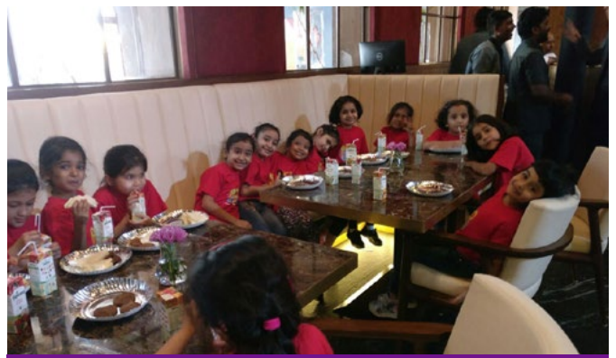
Dining Etiquette at "The Clearing House"