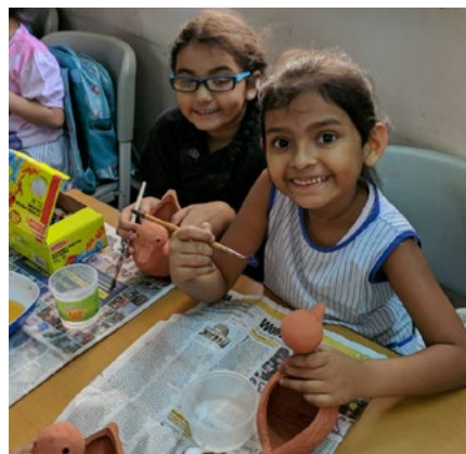
Painting pots to grow our own plants