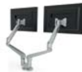
MONITOR ARMS DUAL