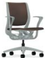
PURPOSE TASK CHAIR