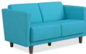
GROVE 2-SEAT LOUNGE CHAIR