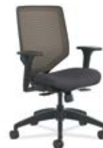
SOLVE TASK CHAIR