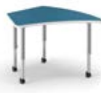
BUILD KITE TABLE