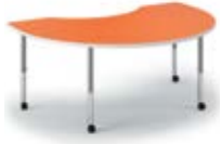
BUILD ARC TABLE