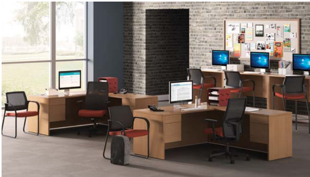
Featured Products Ignition Task Chair, 10500 Series Desk, Contain Mobile Pedestal, Ignition Multi-purpose Chair and Contain Storage Tower.