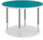
BUILD ROUND TABLE