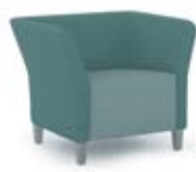
FLOCK SQUARE LOUNGE CHAIR