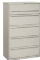
BRIGADE 700 SERIES LATERAL FILES