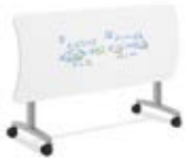
BUILD DART NESTING TABLE