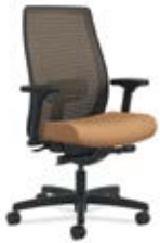
ENDORSE TASK CHAIR