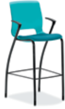
MOTIVATE CAFÉ HEIGHT STOOL