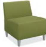
FLOCK MODULAR CHAIR