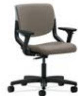
MOTIVATE TASK CHAIR