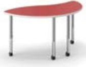
BUILD WISP TABLE