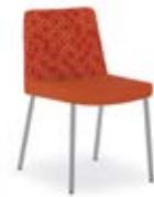
FLOCK CASUAL LOUNGE CHAIR