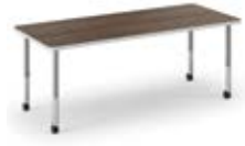
BUILD RECTANGLE TABLE