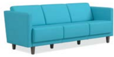
GROVE 3-SEAT LOUNGE CHAIR