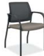
IGNITION MULTI-PURPOSE CHAIR