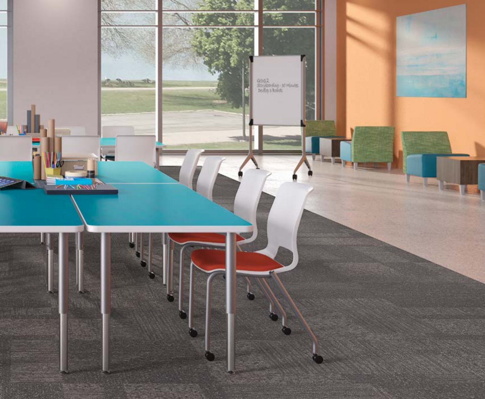
Featured Products Flock Lounge Chair, Collaborative Table with Power, Build Rectangular Table, Motivate Stacking 4-leg Chairs and Mobile Markerboard.