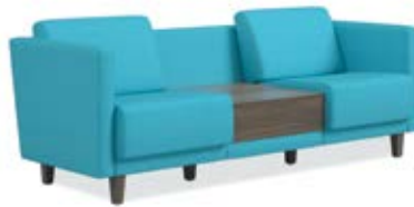
GROVE 2-SEAT W/ TABLE LOUNGE CHAIR