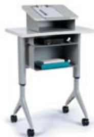
Featured Products Motivate Presentation Cart, Nesting/Stacking Chairs, and Build Ribbon Table.