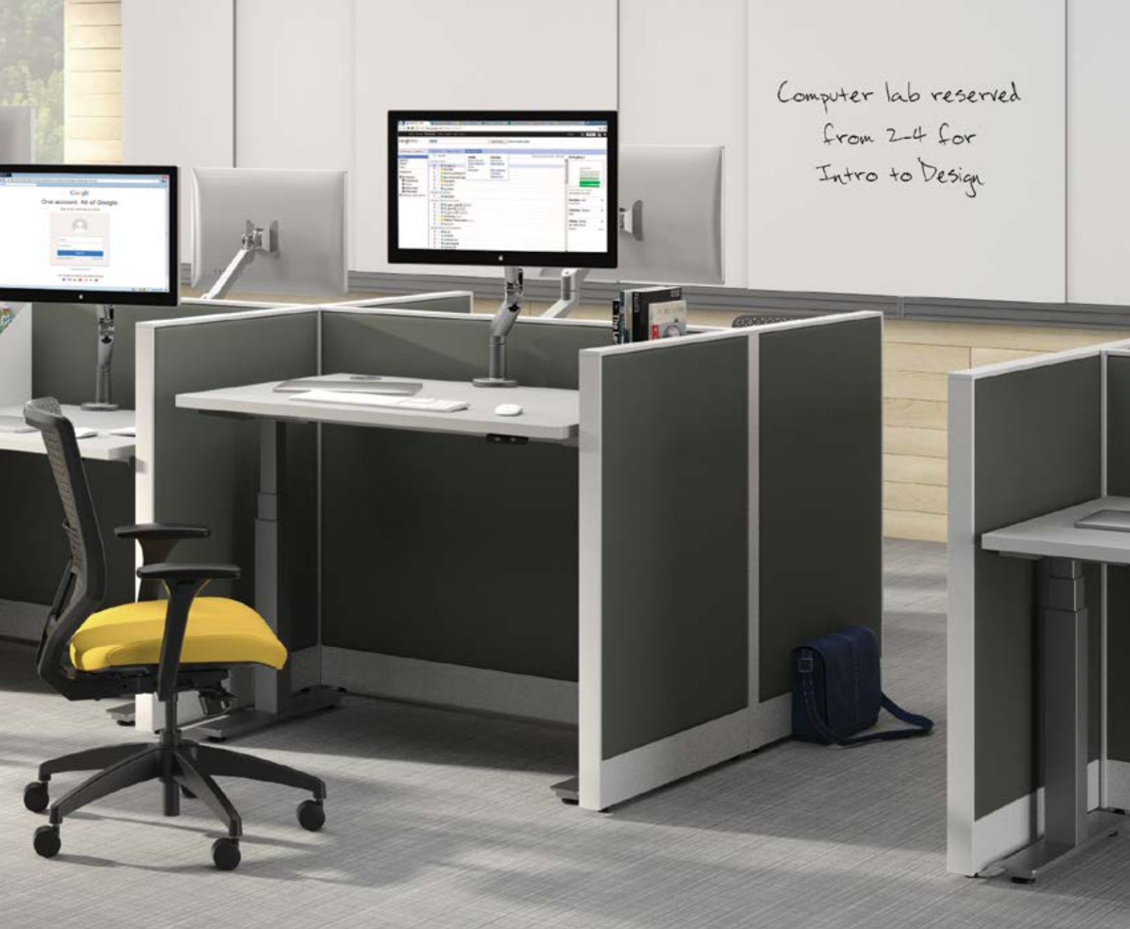
Featured Products Solve Task Chair, Coordinate Height- Adjustable Base, Dual Monitor Arm.

Computer lab reserved from 2-4 for Intro to Design