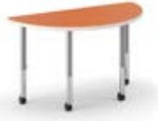
BUILD HALF-ROUND TABLE