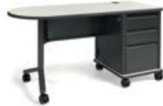
SMARTLINK TEACHER STATION