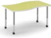
BUILD RIBBON TABLE