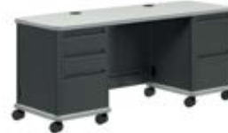
SMARTLINK MOBILE METAL DESK