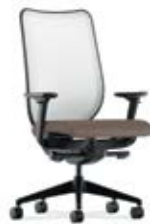
NUCLEUS TASK CHAIR