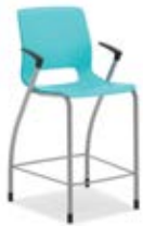
MOTIVATE COUNTER HEIGHT STOOL