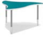
BUILD SNAP TABLE