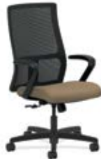
IGNITION TASK CHAIR