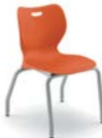
SMARTLINK 4-LEG CHAIR