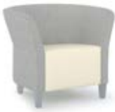
FLOCK ROUND LOUNGE CHAIR