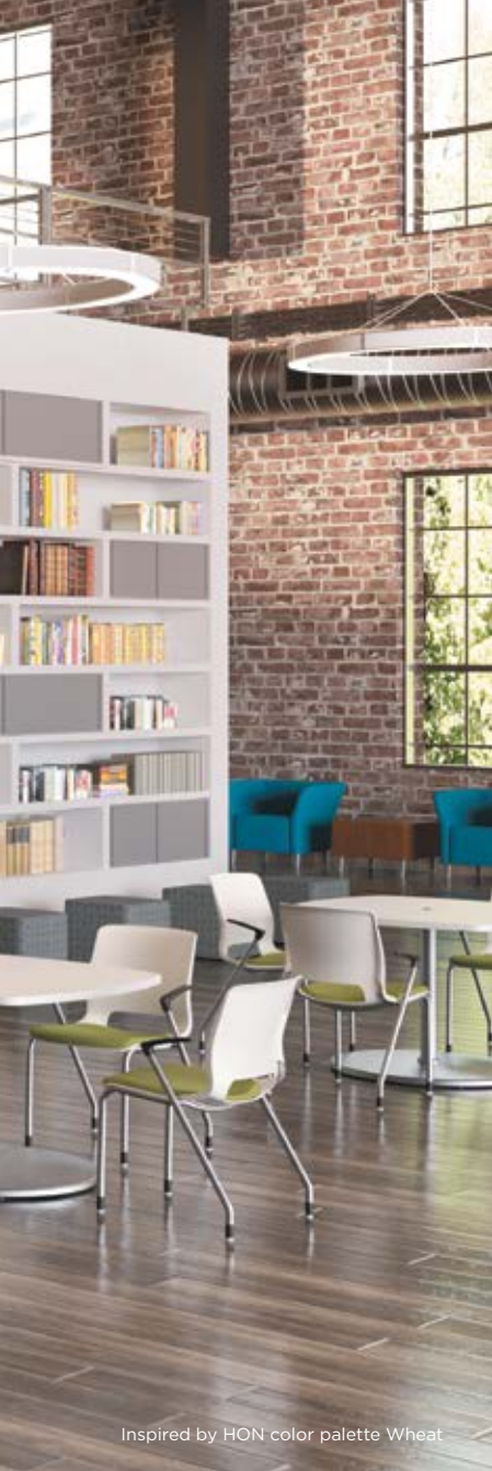
Inspired by HON color palette Wheat