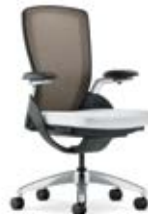
CERES TASK CHAIR