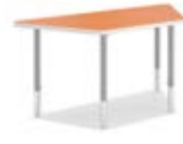
BUILD TRAPEZOID TABLE