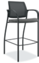
IGNITION CAFÉ HEIGHT STOOL