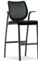
NUCLEUS CAFÉ HEIGHT STOOL