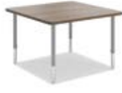
BUILD SQUARE TABLE