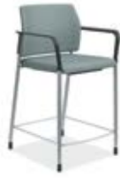
ACCOMMODATE COUNTER HEIGHT STOOL