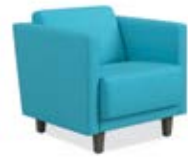
GROVE 1-SEAT LOUNGE CHAIR