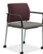
ACCOMMODATE GUEST CHAIR