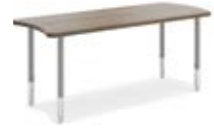
BUILD DART TABLE