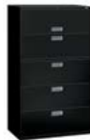
BRIGADE 600 SERIES LATERAL FILES