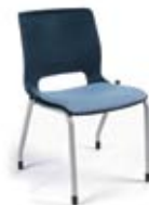
MOTIVATE 4-LEG STACKER