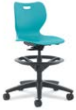
SMARTLINK TASK SWIVEL STOOL