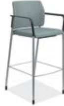
ACCOMMODATE CAFÉ HEIGHT STOOL