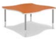
BUILD TIDE TABLE