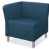
FLOCK MODULAR END