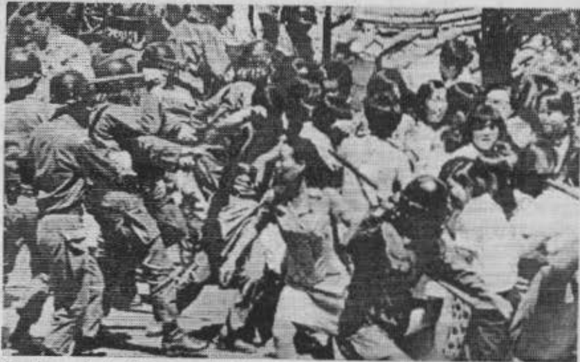
Students clash with riot police during a demonstration.

these cities. They faced off against thousands of south Korean riot police. The students were protesting against both the south Korean government and the U.S. militarization of the peninsula. They saw the U.S. military as the biggest obstacle to the peaceful reunification of their country, which had been divided ever since World War II.