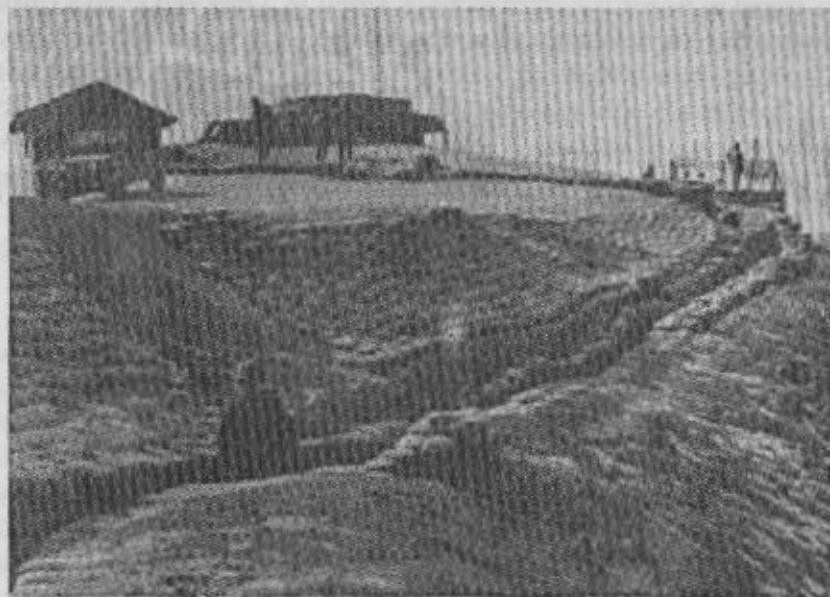
One of the heavily fortified U.S. guardposts in the DMZ.

The contents of the boat were described by the officer as "two