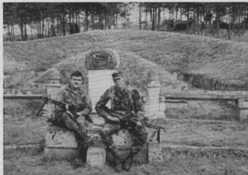
The author, right, and another soldier relaxing on a Korean grave site during a break from the "fighting" in Team Spirit '86.

The beam is extremely damaging to the eyes. The Army cautions its soldiers not to look into it or point it at "friendlies" for fear of causing permanent blindness. In fact, during war games that pit